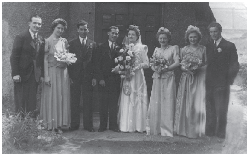
This photograph was found in a book handed in at Lanchester library, from which it can be reclaimed.