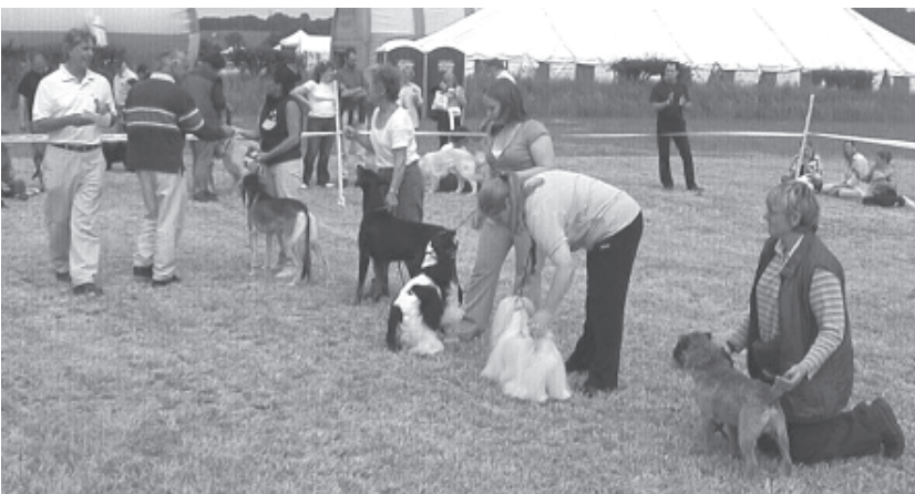
The dog show was run under the auspices of the Kennel Club