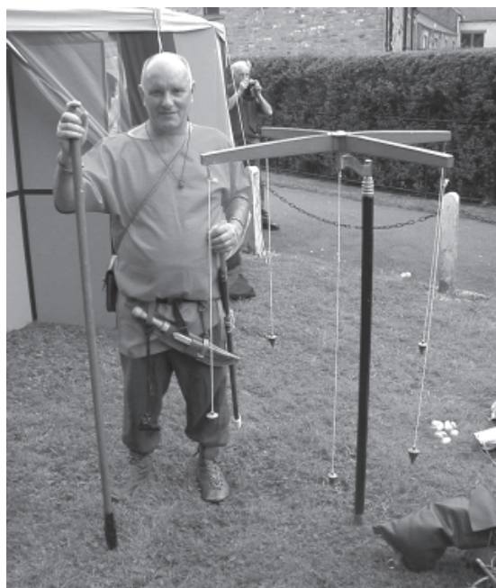
One of our Roman visitors demonstrates the latin version of a theodolite which kept Roman roads so straight