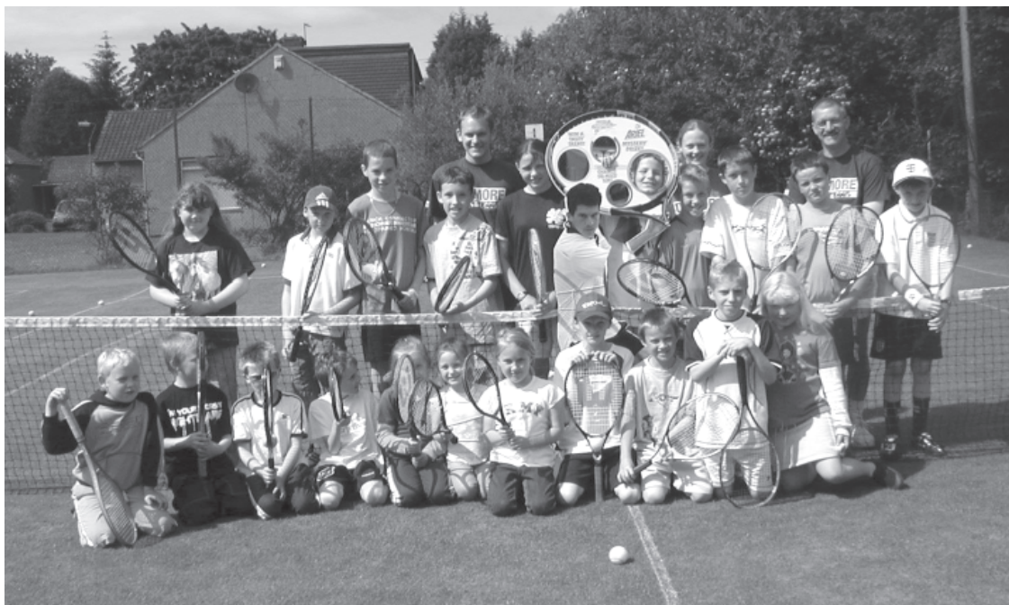
Children who attended the coaching session at Lanchester Lawn Tennis Club. A slim line Tim Henman (centre) also turned up due to his early exit at Wimbledon