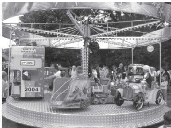
A new roundabout at the Carnival was very popular

superb atmosphere on the day. It was a wonderful day with glorious sunshine which everyone seemed to enjoy. The profit after expenses and donations is approximately £2500 which will go to a very depleted Lions Welfare Fund. The Lions would like to say a very big THANK YOU to everyone.