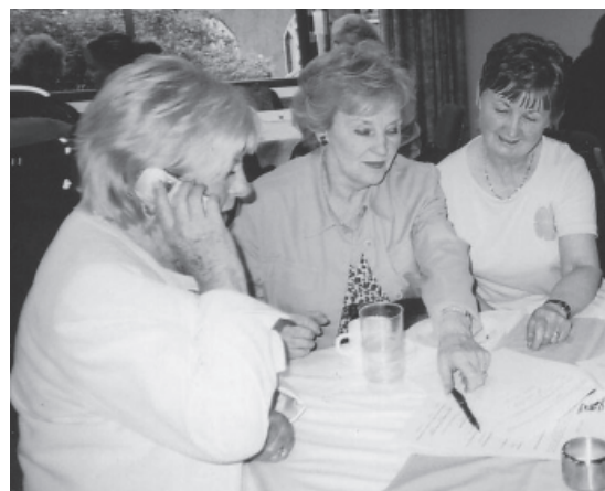
Doing the quiz at 'Tea at 3'. Can I phone a friend?