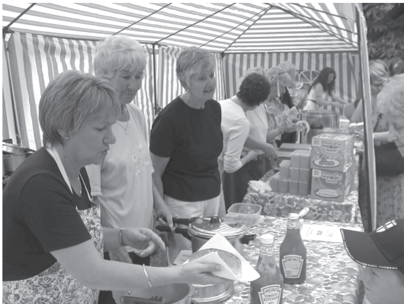
The Lady Lions worked all afternoon to feed the ravening hordes