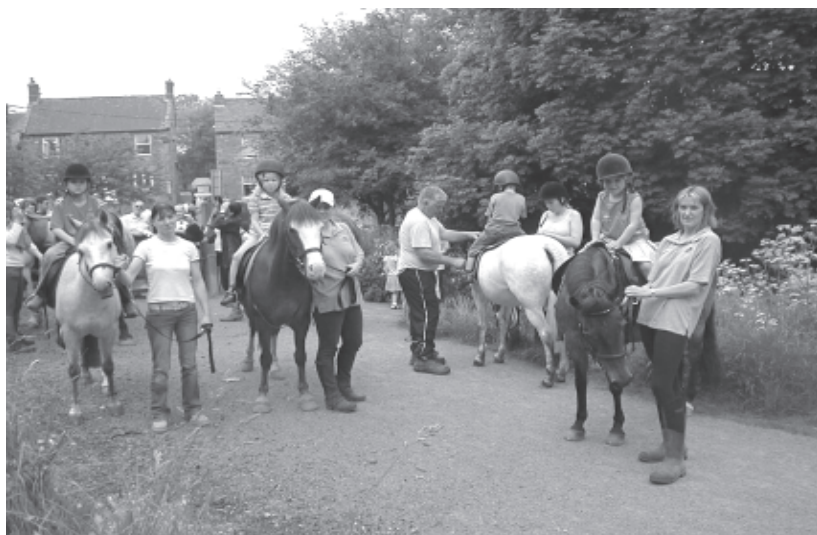
Horse rides along the railway line, offered by Oakwood Stables, were so popular that more ponies had to be sent for