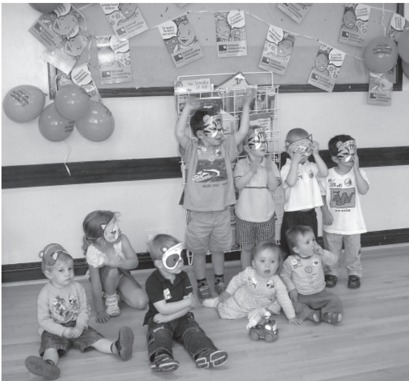
Some of the children "making chatter matter"

by holding a sponsored sing-along picnic. This year's theme was "Make Chatter Matter". The money raised by the children was donated to ICAN, a charity which helps children with speech and language difficulties across the UK.