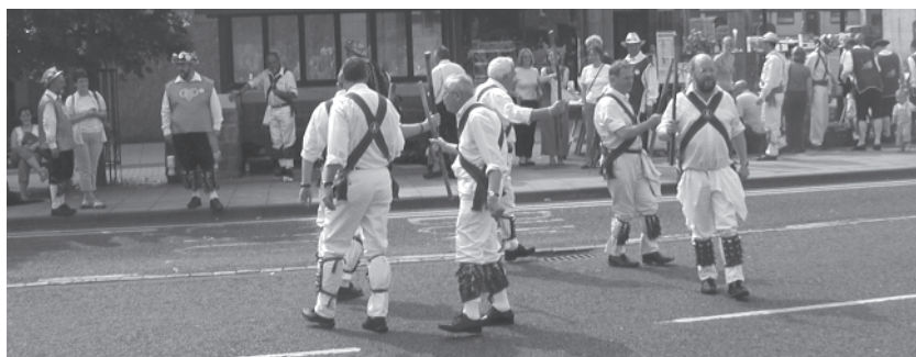
This year Morris dancers entertained at the Carnival