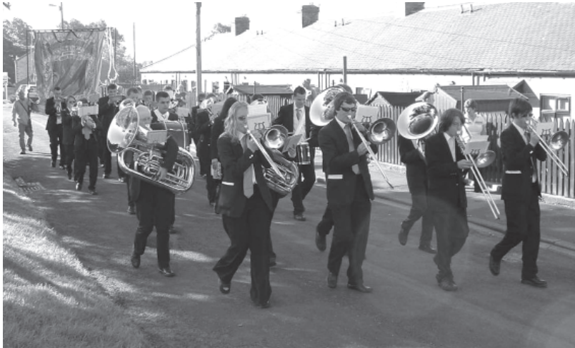
Lanchester Brass band sets off from Ushaw Moor

traditional, playing before leaving Ushaw Moor for Durham. An early start is needed with breakfast being provided at 7am. In spite of it being such a hot day they enjoyed the occasion.