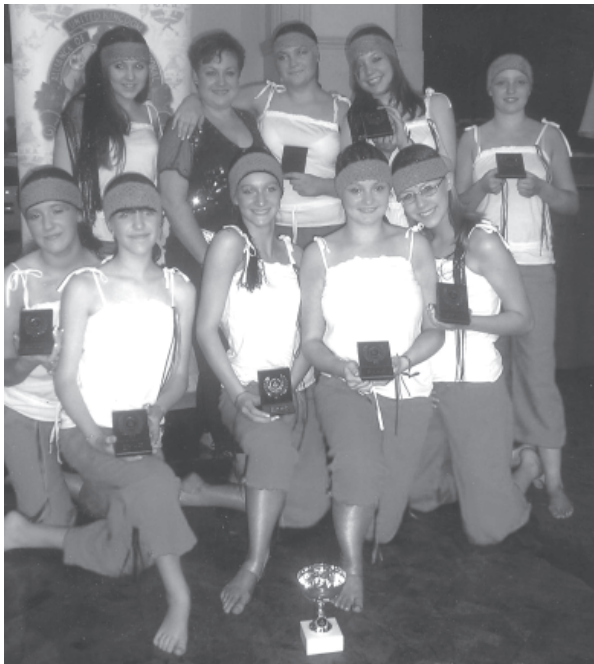
The KSDA dancers