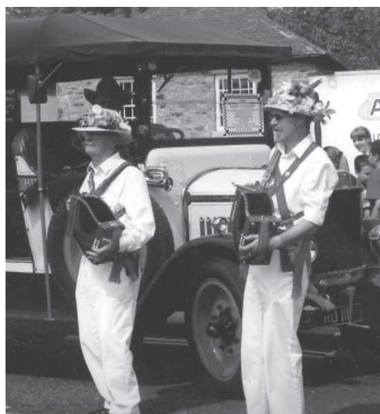
These musicians accompanied the Morrismen