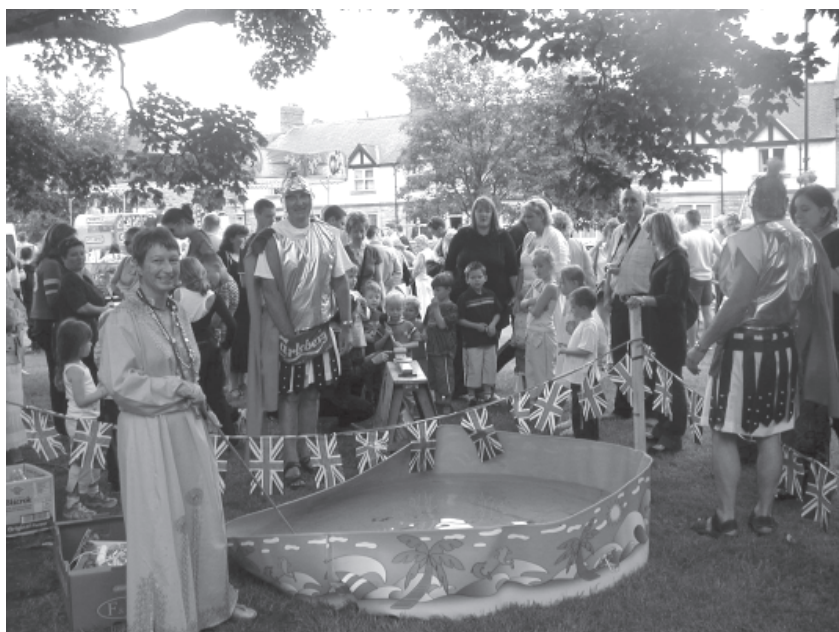
Romans invade the frog hopping game