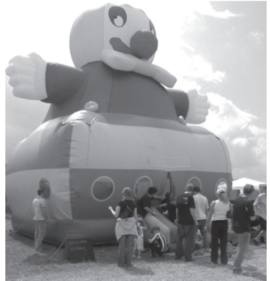
This monster bouncy castle was a hit at the Show

Local businesses contributed generously to a raffle.