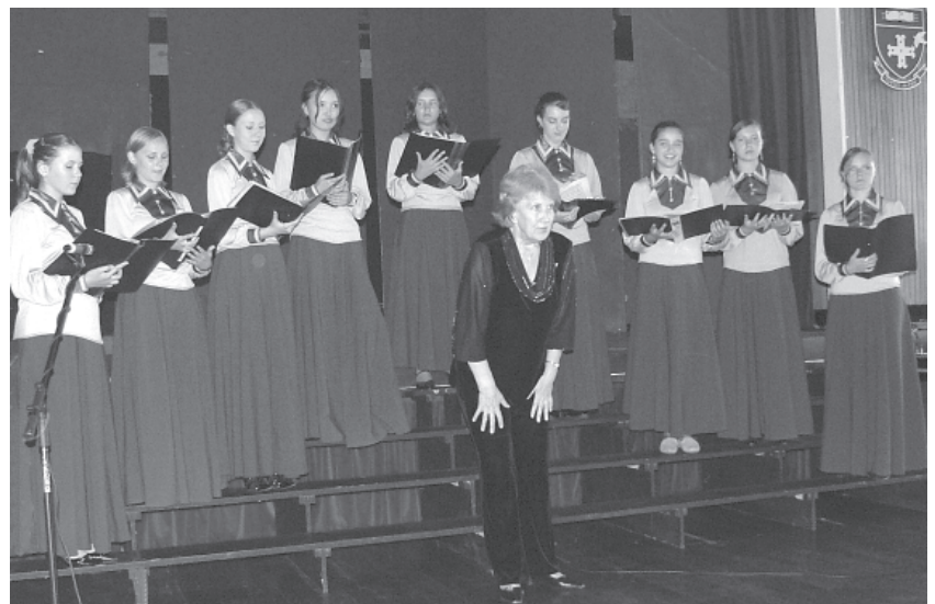
The choir from St Petersburg entertain at St Bede's

accuracy were amazing. Staff from both schools exchanged compliments and hoped that the exchanges would continue in the future.