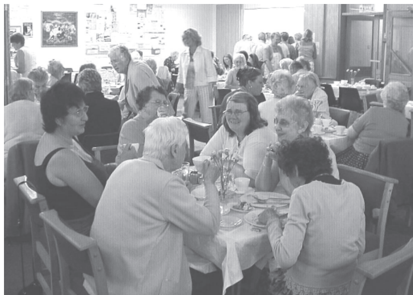
The busy lunchtime at the "Open House"