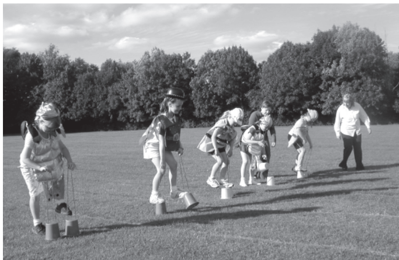
A rather tricky race at the Brownies' sports day