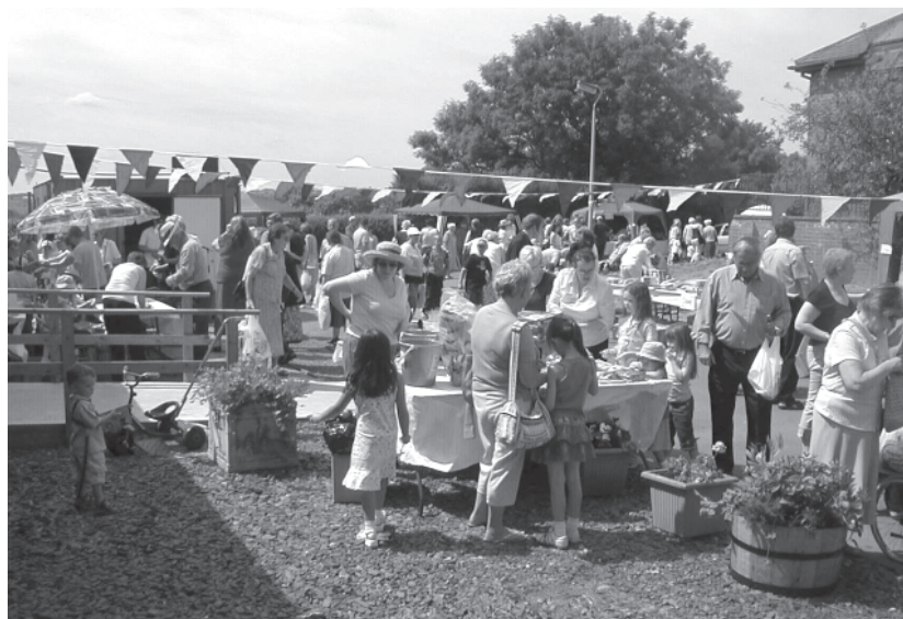
Willowburn Fair, held in blazing sunshine on Saturday 9th July, attracted swarms of people who spent generously, especially on refreshments and ice cream