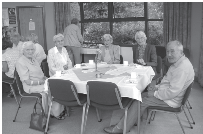
Local residents enjoying their 'tea at 3' in aid of Willowburn

Willowburn was one of many Hospices which joined in the national fund raising event 'Tea At 3' which was held at the Catholic Hall on Friday 17th June. Thousands of people across the country in schools and workplaces took part in the event and there were many who gave donations during their normal tea breaks. 'Help the Hospices' is a national charity for the hospice movement which coordinates UK fundraising.