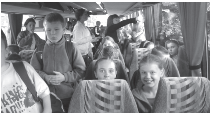
Excited children prepare to sing the 'wheels on the bus go round and round'