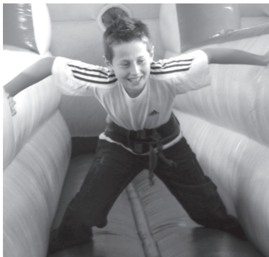
A contestant tries the bungee run

soon and hopefully will be completed within two years. The Friends of St Bede's would like to thank everyone, including local businesses, who has contributed to and supported the Fayre.