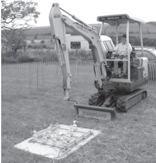
The game of digger skittles was popular at the Show

After two years of unpleasant weather, the sun shone on the Lanchester Show on July 2nd and 3rd and attendances improved. For the first time the show was attended by