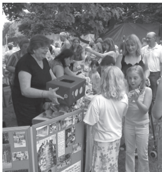
Stalls and a tombola collected for the Russ Foundation children's home in Madurai, India.