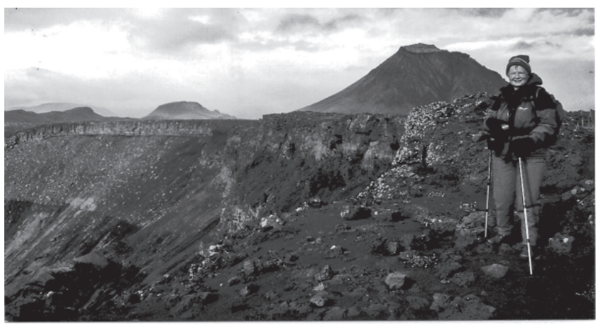
Rhoda Joyce during the Ice Cap Challenge

On Sunday 21st August I Hospice in Hexham and arrived in Reykjavik along Macmillan Cancer Relief with 25 fellow trekkers for this region ready to start our Ice Cap involved a Trek of over 60 Challenge the following miles through a landscape day. The Challenge was in of incredible contrasts and aid of two Charities beauty. We hikedover wild