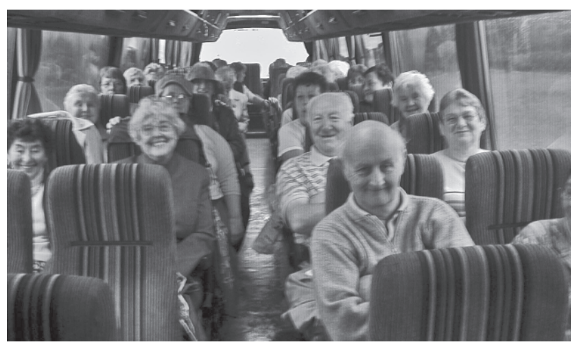
The pilgrimage to Our Lady of Walsingham starts on a wet morning in Lanchester