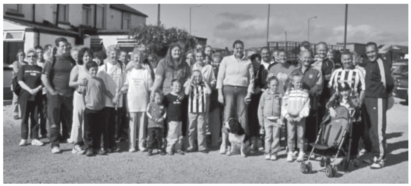
The start outside the Brown Horse of a successful sponsored walk for Willow Burn

On behalf of the Willow Burn Hospice committee I would like to thank all the people who completed our annual sponsored walk, over a hundred were counted.