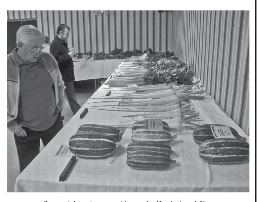
Some of the prize vegetables at the Horticultural Show