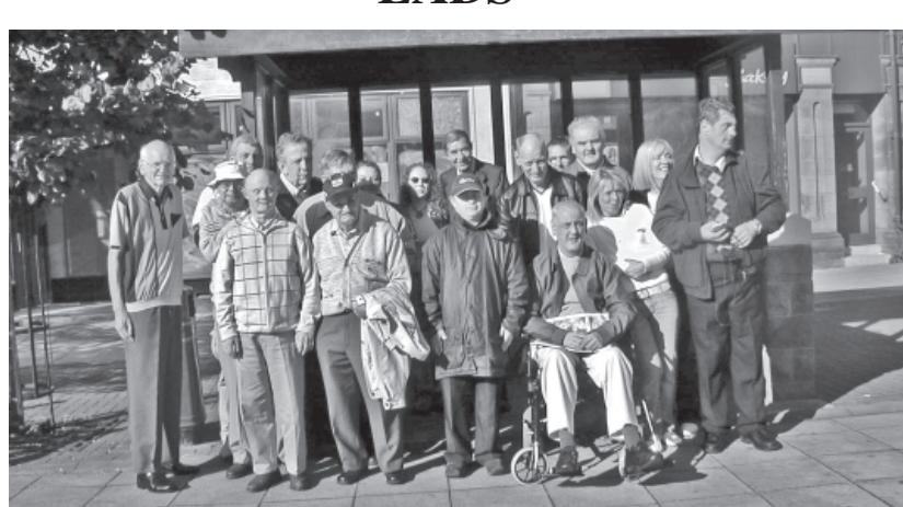
The 'Lads' from the local Care homes set off on a day trip to Whitby, courtesy of Lanchester Lions