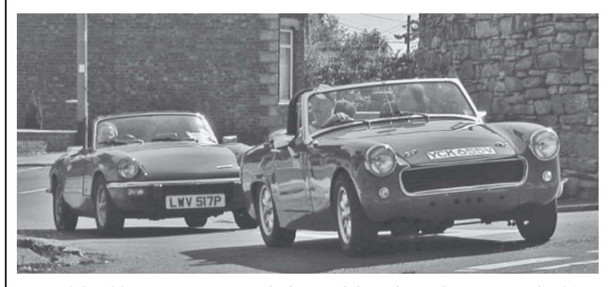
Two of the 120 or so vintage cars which passed through Lanchester on Sunday 21st August, which were taking part in the 20th Burnhope Vintage Car Rally