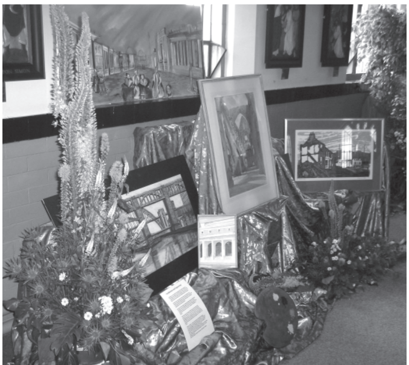
The 'Architecture and Engineering' display at the Flower Festival

3 Ivy Terrace, Langley Park, Durham DH7 9XW