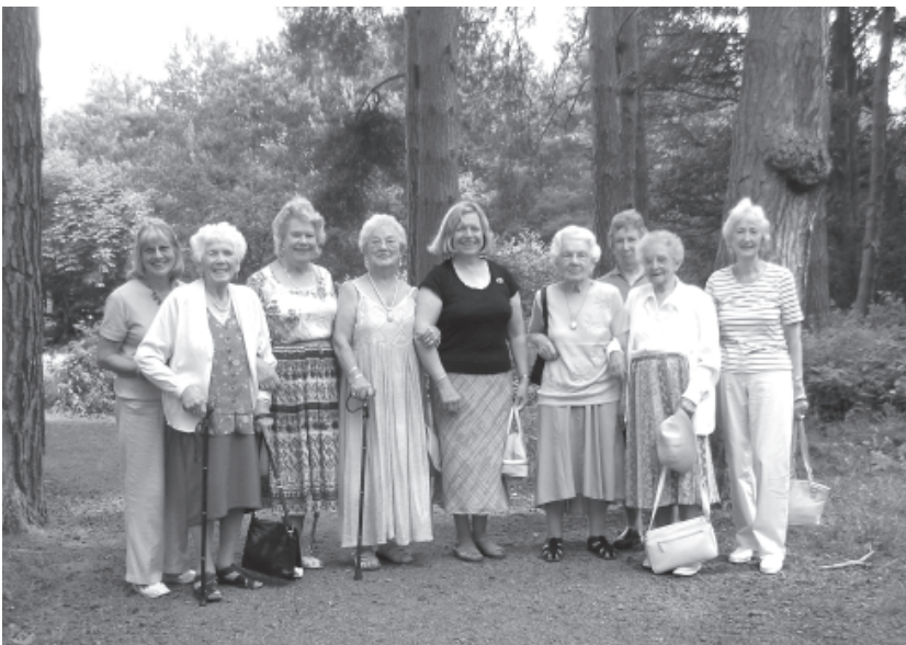
Inspired by the fine weather, the Amigos group and their helpers decided on an outing on Friday 30th June. Where better for a short stroll but the riverside at Malton country park.