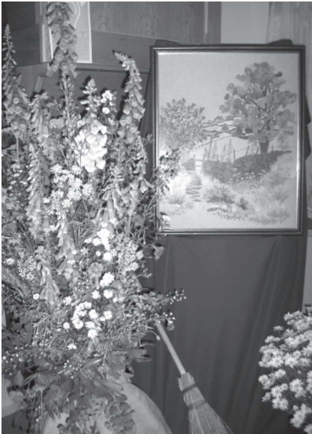
A beautiful cross-stitch picture decorated with flowers