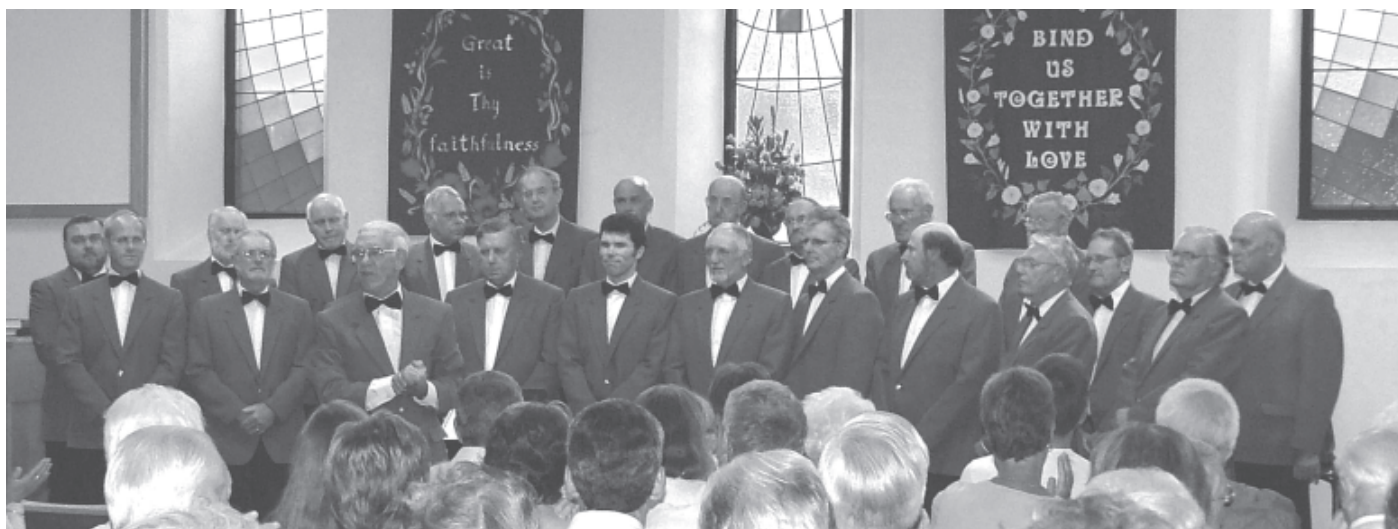
Lanchester Male Voice Choir in Concert