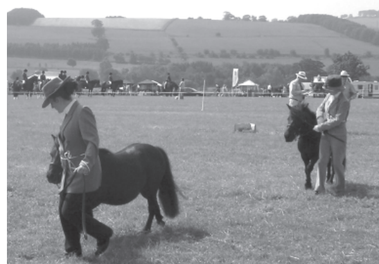
Some entrants in the Shetland pony class