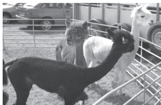
A great attraction at the Show were Strothers' strokeable alpacas