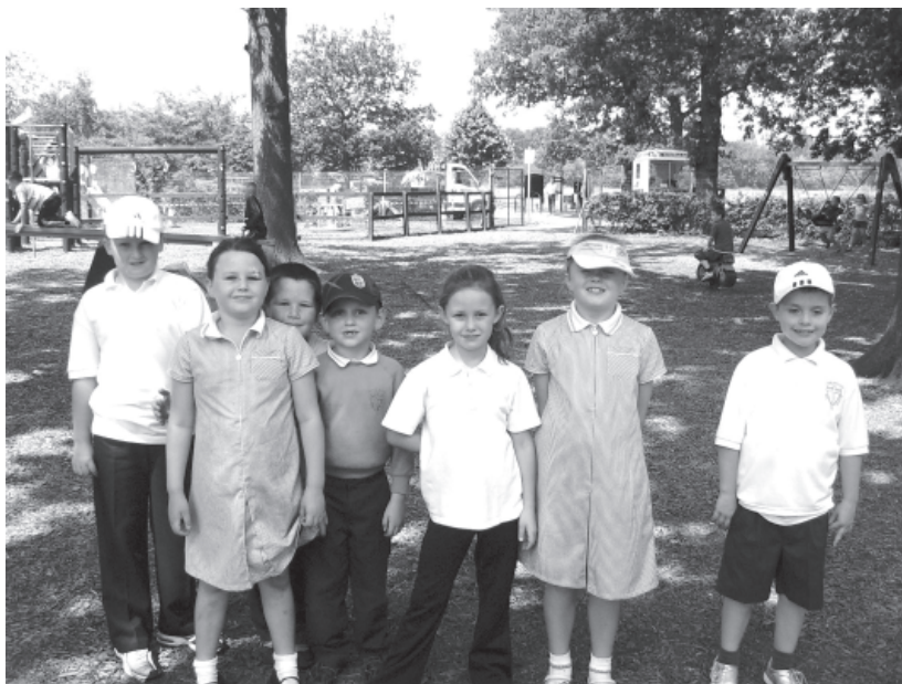
Some of the children at Preston Park

bellows, copper bed warmer, and a poss stick and a carpet beater. After that class 2 went for lunch I had ham sandwiches, crisps, a rocky and a drink. After lunch class 2 went to the park. Finally class 2 went to the gift shop I bought some coins. I had a great day. By Emily