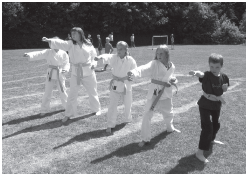
The Karate display

- ALL WORK GUARANTEED - FREEPHONE: Andy 0800 5872873 Mobile: 07753 353906