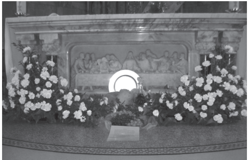
'The Last Supper' arrangement

As a result of the festival, more than £1200 will be added to the Organ Restoration Fund.