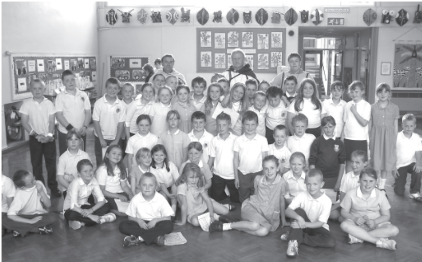
Pupils from All Saints and EP School enjoying the Roman Day

On 29th June a group of twenty-three 'Roman' enthusiasts from class 3 at All Saints' sallied forth to join like-minded pupils from several local primaries for an historical workshop at the EP school.