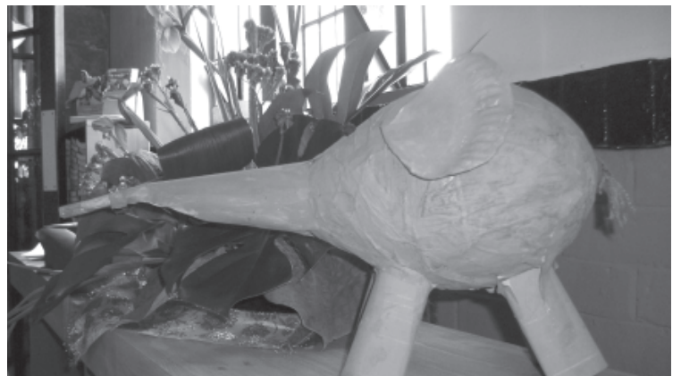
The artistic blue elephant by Ellen, aged 10, with attendant flowers

Like teenagers everywhere, Lanchester teenagers have lots of energy. Most of them find healthy ways of burning it off, but some don't always, and can be a nuisance in the village.