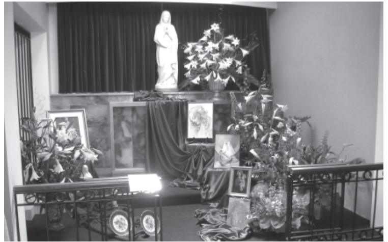
Related pictures and flowers join the resident statue of the Madonna