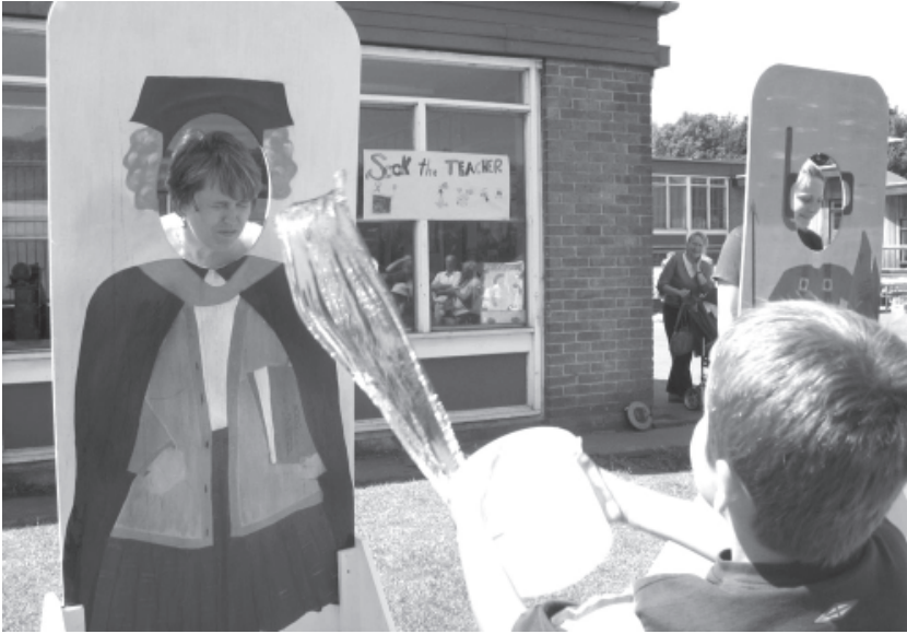
Soak the Teacher, the most popular stall

Organised by 'Friends of July in sweltering the School', the Fair took sunshine. The fair was place on Saturday 15th mainly geared to children, and many hundreds of people attended making it a rip-roaring success.