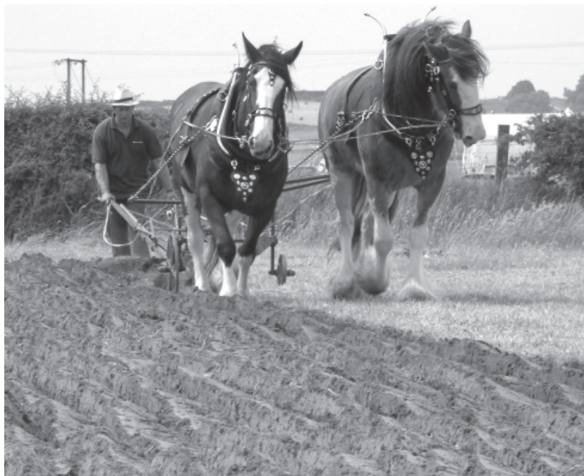
Above, the Beamish horses, Bonnie and Clyde

73 Medomsley Road, Consett, Co. Durham Telephone: 01207 582131