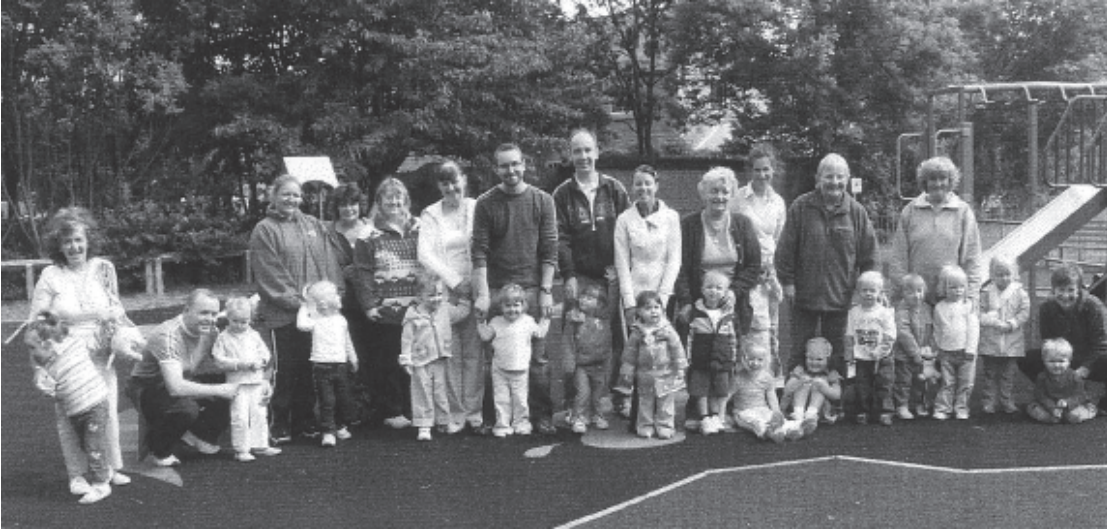
Toddlers of all sizes at Park House play area

Twenty small members of Lanchester Playgroup, accompanied of course by dads, mums and grandparents enjoyed a sponsored toddle around the play park on Wednesday 21st June in aid of the SPACE project to extend the Community Centre and raised the excellent sum of £258.50. Fine weather prevailed and sturdy little legs did four, or in some cases five circuits of the site before enjoying a well-earned drink and biscuit. Full use was made of the play equipment and a good time was had by all.