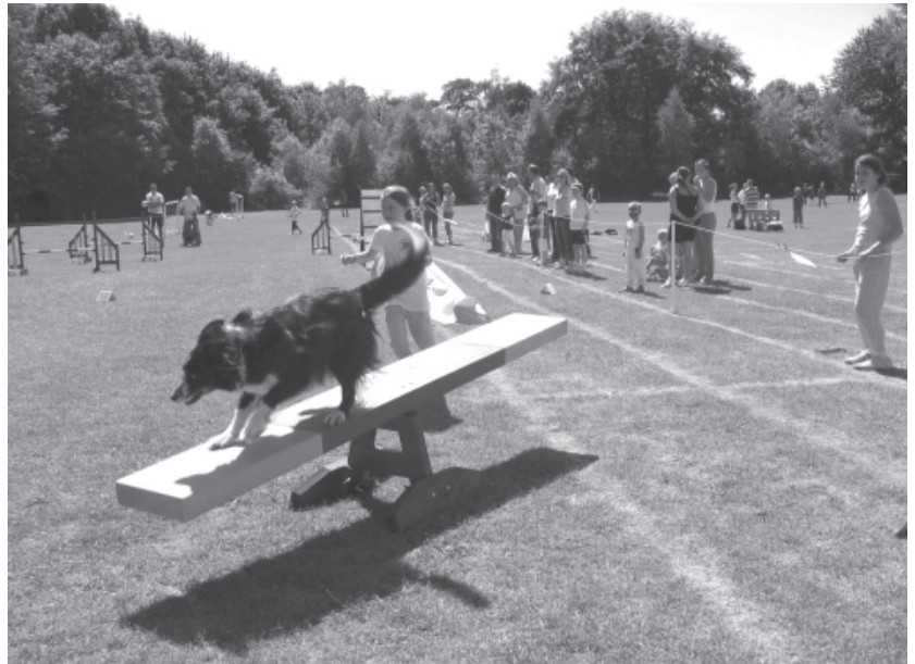
The dog and child agility course