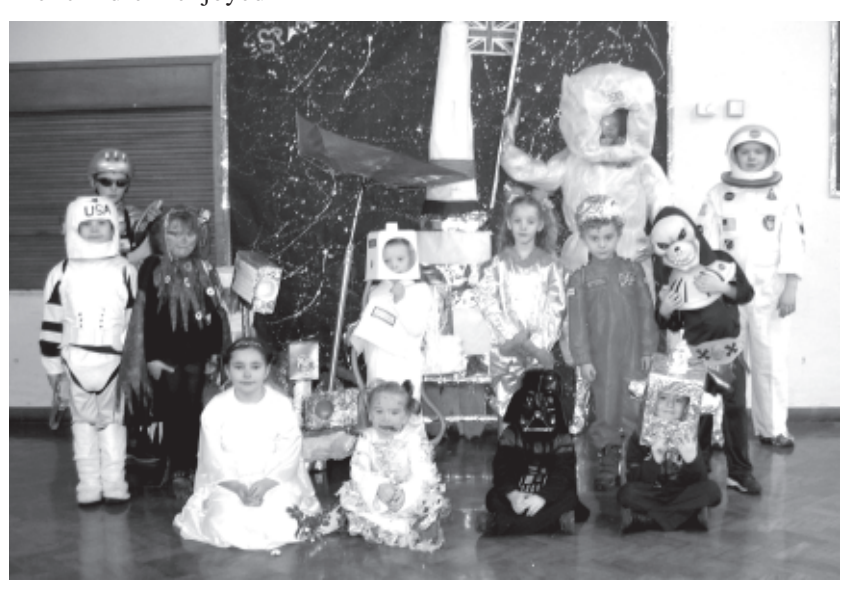
Imaginative costumes worn by children from the infant classes