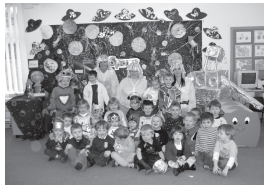
Nursery children in their space costumes