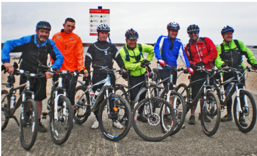
The group at the finishing point in Sunderland

In the autumn of 2010 seven personnel from the Chester-le-Street Bus Depot of Go North East initiated a plan for a charity cycle ride which would be completed in May 2012. With a large contingent of Ex-Servicemen working in the establishment it was decided to raise funds for the local branch of the Royal British Legion. With the charity and individuals signed up all