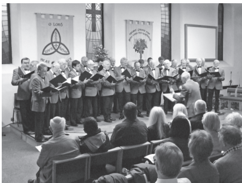
Lanchester Male Voice Choir entertain a full house

polished, confident performance from a talented young lady who brims with personality. And finally to the choir itself. I think it is now safe to say the choir has successfully made the transition from a small choir to a medium sized one. They appeared more confident and tighter than on their Patrons' Evening a few months ago; the new members are fully integrated and they sounded superb. This has inevitably come at the short term expense of not introducing many new songs on this occasion but I'm sure their many fans will forgive them that. The choir is now on a strong footing both numerically and musically.