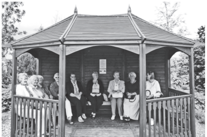
The Flower Club members enjoy a seat in the garden summer house

look forward greatly to our annual outing to some beautiful gardens and most definitely our delicious lunch with convivial conversation with our friends and our acquaintances.