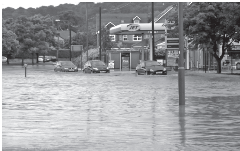
The entrance to the village is completely flooded