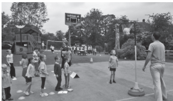
Well done lad - Harlem Globetrotters look out.

It was planned to have Sports Day on the 26th of June. In the morning the children enjoyed a non competitive carousel of several different activities changing over at about 10 minute intervals with the serious