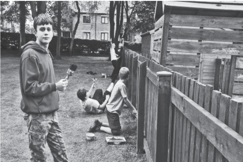
Brushes to the ready and some painting going on when we took this picture of the 'work' at the nursery fence of the EP School