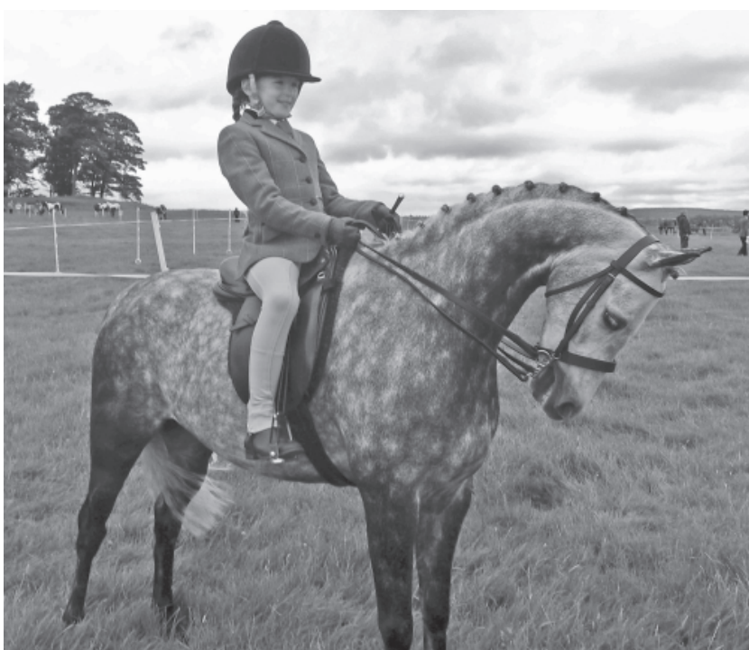
'King's Row Valentino', a nine year old open show hunting pony and his young rider