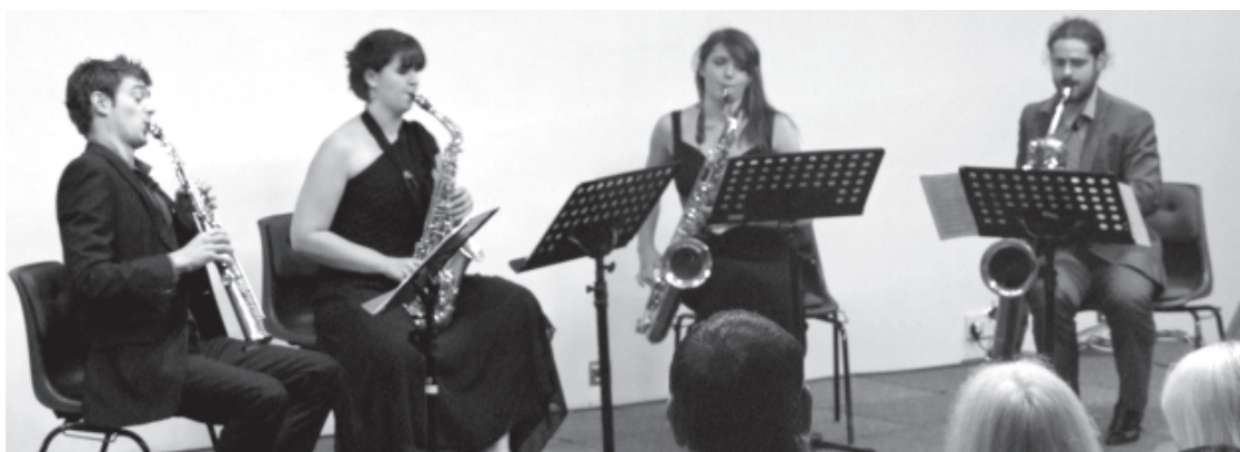
The Absolution Saxophone Quartet, guests from the Royal Northern College of Music

Once again the choir dug into the gold mine of musical talent that is the Royal Northern College of Music in Manchester and came up with a rare nugget, The Absolution Saxophone Quartet. How many of us have had the chance to listen to a