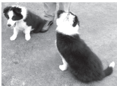
Baby border collies 'Mist' and 'Tag' make their first visit to a show

their paces before the competitions. Congratulations must be given to the organising team, for their huge efforts in producing the event, with everyone hoping that a return to its usual venue will be possible, with an even bigger and better Show in 2013.