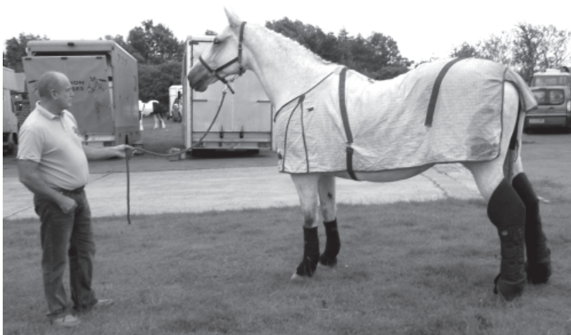
'Autumn Fox' Supreme Champion of 2011 makes his return to the Show

The torrential rain which hit our area over the past weeks resulted in the Lanchester Agricultural Show being relocated, and its content sadly restricted. With local fields waterlogged, the new venue for the Show was Streatlam Park showground, at Barnard Castle where there were good dry standing areas available. Unfortunately, the change of location meant there was insufficient time to apply for a Movement of Animals licence to transport livestock, as required by DEFRA, and only horses and dogs could be shown.