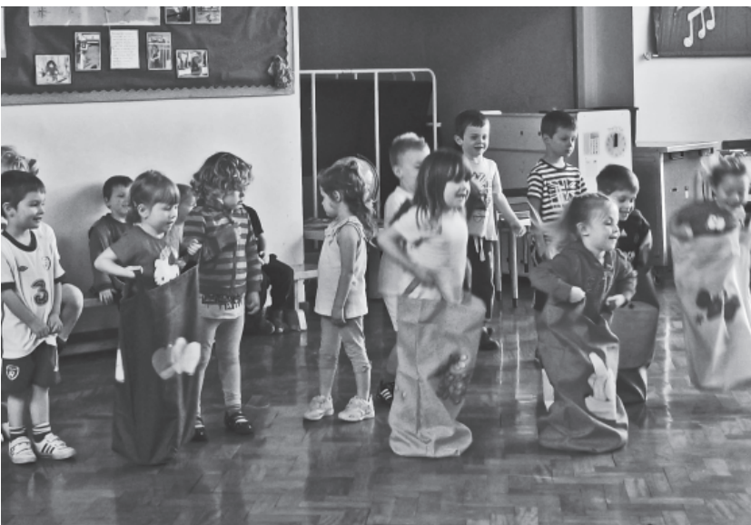
The sack race looks as if it's being enjoyed although some might be a little impatient to get their turns whilst others wait patiently. Some find out that it's not as easy as it looks.

own series of activities. They listened carefully to find out what to do, then got down to the fun. The bean bag race was very popular, and some children discovered that taking part in the sack race wasn't as easy as it looked! Once again, although the events were non competitive, the children had fun working together in teams. All the children were awarded a certificate to celebrate their achievements, and were all looking forward to a reward of a lolly!