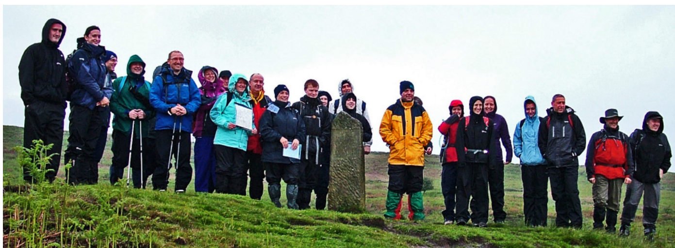
The Lyke Wake Walk participants pose for a photograph during their 40 mile trek which raised £9,342 Story on Page 23