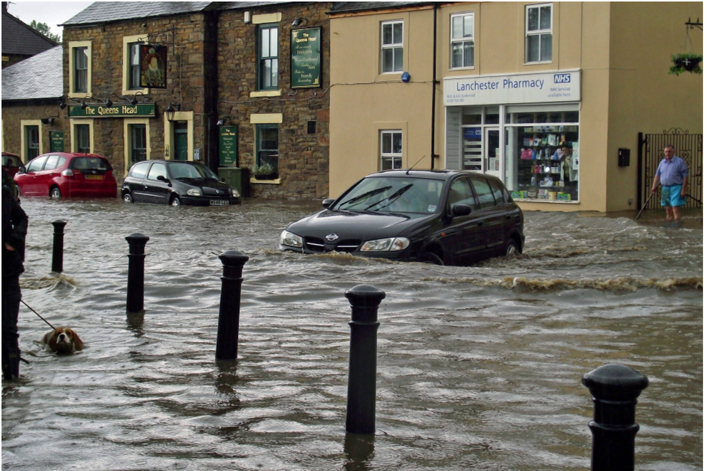
Incredibly someone races into the village, turns the car round and drives off, causing more unnecessary water damage. The little dog enjoys the unexpected swim.