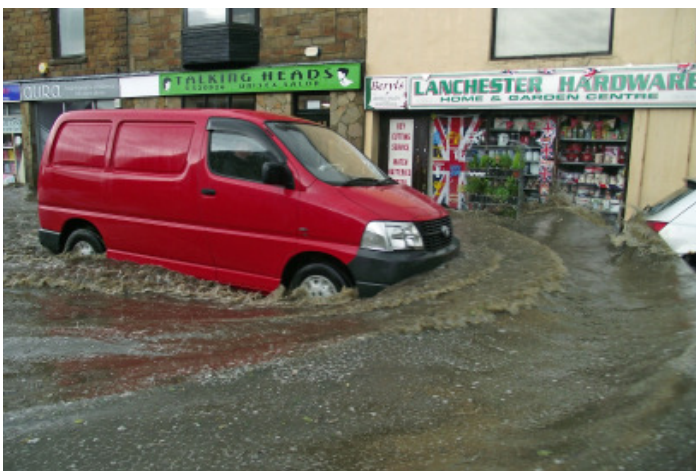
Irresponsible drivers make matters worse with waves flowing into various premises