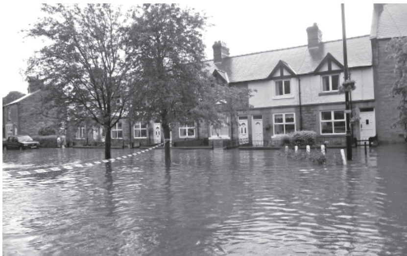
A devastating picture of Church View from which all residents were evacuated to the King's Head

Water came in torrents into the village centre from Newbiggen Lane, Cadger Bank, Ford Road and Maiden Law Bank which in effect became like four fast flowing rivers. The normally calm Smallhope Burn changed into a raging river overflowing its banks in various places causing untold damage. The bypass near the garage became a peaceful looking vast plane of water. Traffic was gridlocked and it took several hours for people to make very short journeys. The village was cordoned off for hours. Several