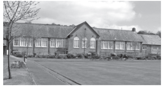
The former Derwentside College building, known as the Green School

The Parish Council thinks that members of the community may be concerned about the proposals, so it is encouraging residents to