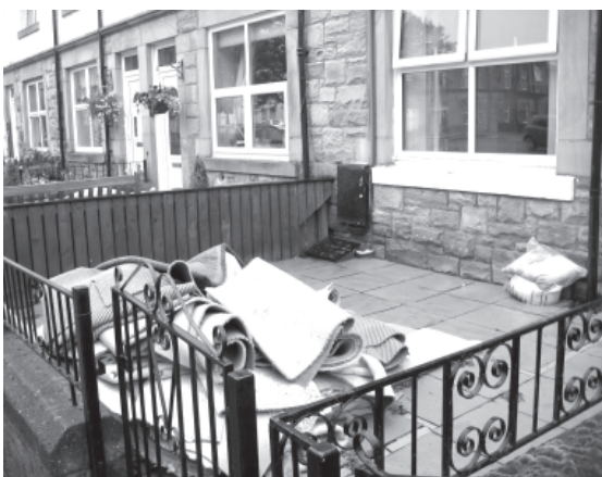
A sad sight - ruined furnishings strewn across the front garden of a home in Church View. Every house was affected by the flood in his area.