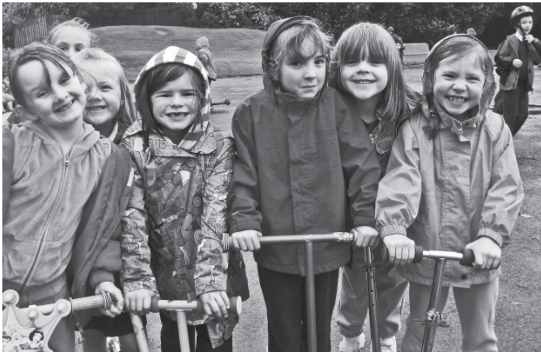
Almost singing in the rain