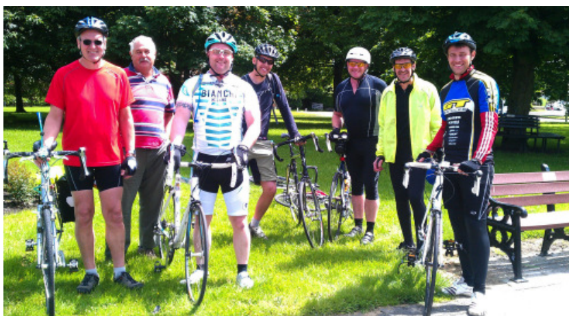
Thanks to Bob Glass who came across these intrepid travellers during a refreshment stop in Lanchester

It's always nice to have visitors using the village facilities, especially those raising funds for a good cause. The riders raised over £1000 for the charity. If anyone else wishes to donate, they can do so on www.justgiving.com/Dan-Armstrong .