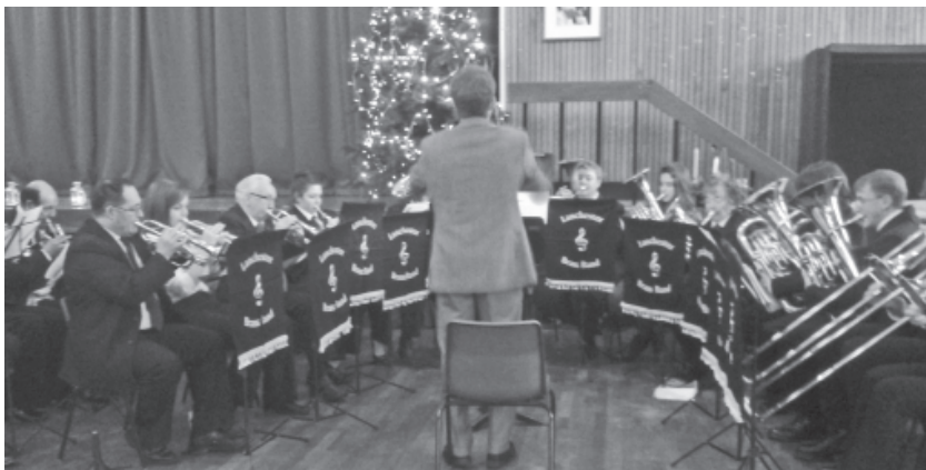
Lanchester Band playing at 'Light up a life'