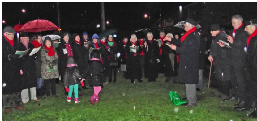
Lanchester Choral and Operatic Society braved the weather to sing their hearts out.