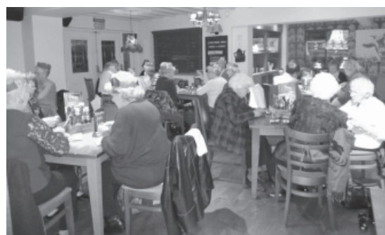
Thursday Club members ready to indulge at the Duke of Wellington

Merry Christmas and a Happy, Healthy and Lucky New Year to everyone.