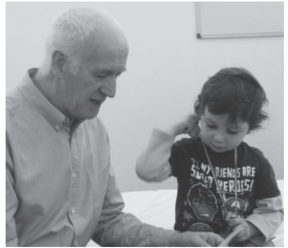
Author, Terry Deary, with one of the children at the RVI.

Terry Deary commented, "I fully endorse the storytelling project. Entertaining young people using stories is dear to my heart and seeing their reactions makes it clear that this idea is extremely worthwhile. It makes a wonderful change for children undergoing cancer treatment to