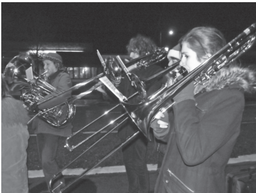
Lanchester Brass Band played stoically throughout the appalling weather conditions and cheered up the crowd with rousing Christmas carols.