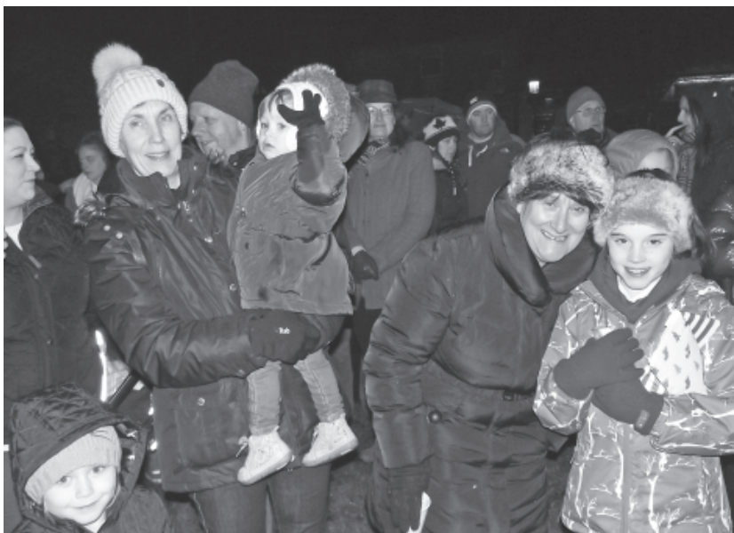
The large crowd certainly enjoyed themselves despite the torrential rain.