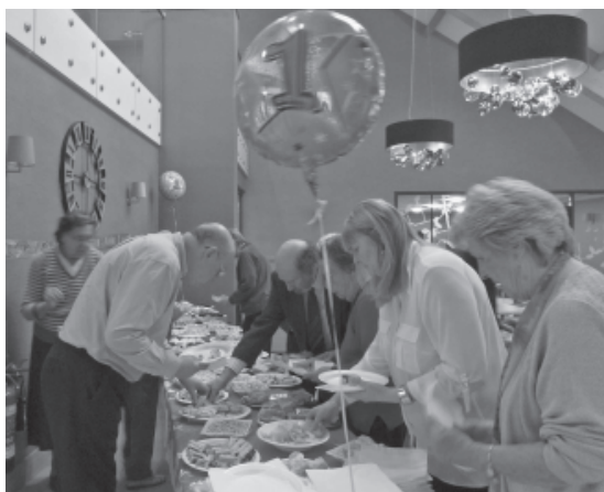
Party guests tuck into the buffet.