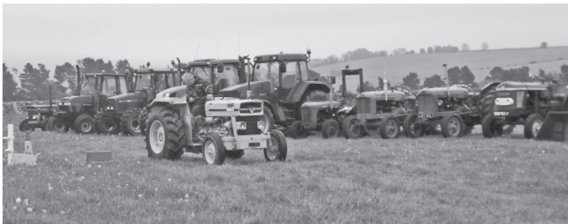
Lining up, ready for the start of the Run.