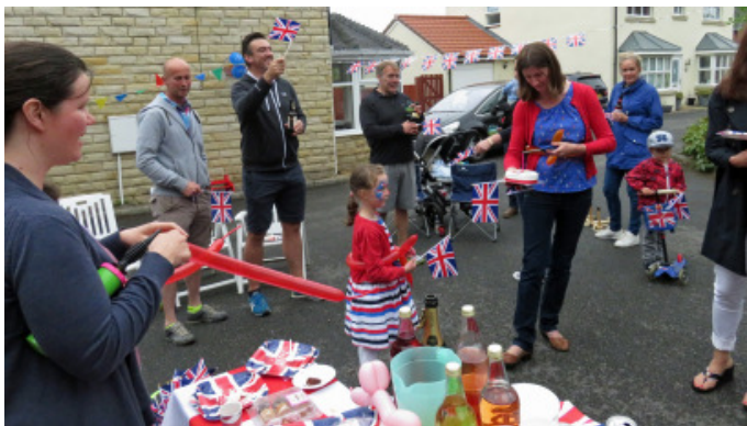
The street party well under way with balloons and bunting.