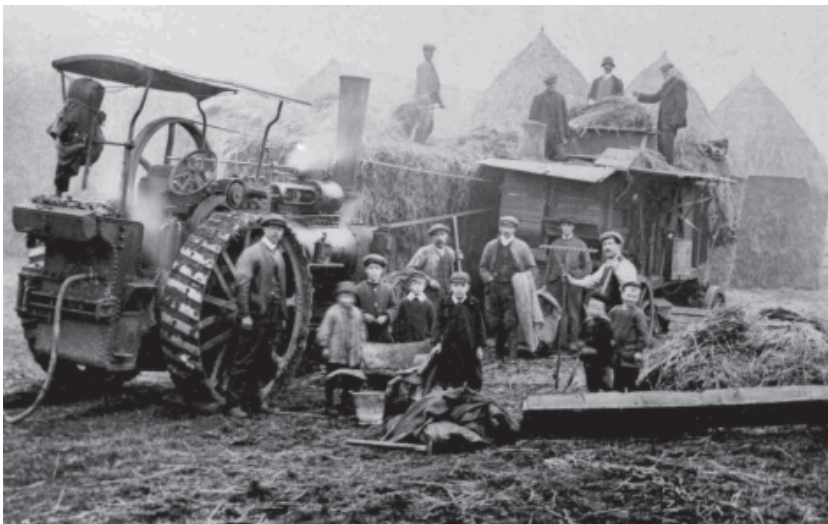
At harvest time all the family were called in to help, including children. This photograph shows a threshing team at the time when steam traction engines were in use.