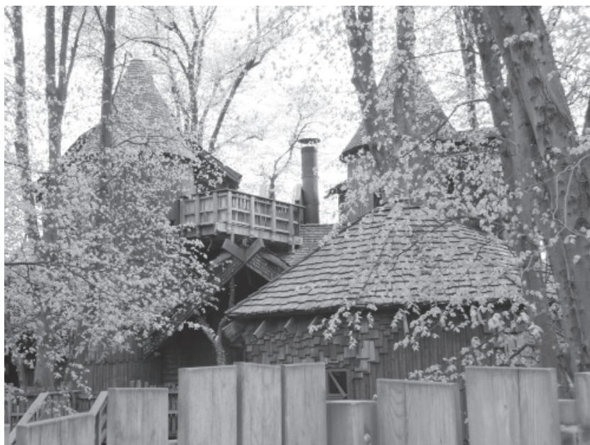
A view of the wonderful Treehouse.

ALL TYPES OF PLASTERING AND BRICKWORK Re-Skims, Ceilings, Concreting, Pointing ... etc Over 20 Years' Experience. All Work Guaranteed