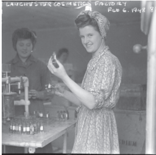
A worker at the Siris cosmetics factory that sold their products internationally and employed a large predominantly female work force.

Apart from those working in the service industries, most modern Lanchester residents have to commute to their place of work, but this was not the case in the past. As these historic photographs show, Lanchester was once a hive of industry. While the agricultural industry remains, nowadays it employs far fewer workers than shown in the old photographs. The cosmetics factory is long gone as has the village saw mill. These photographs show