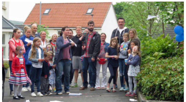
The adults flying paper aeroplanes.