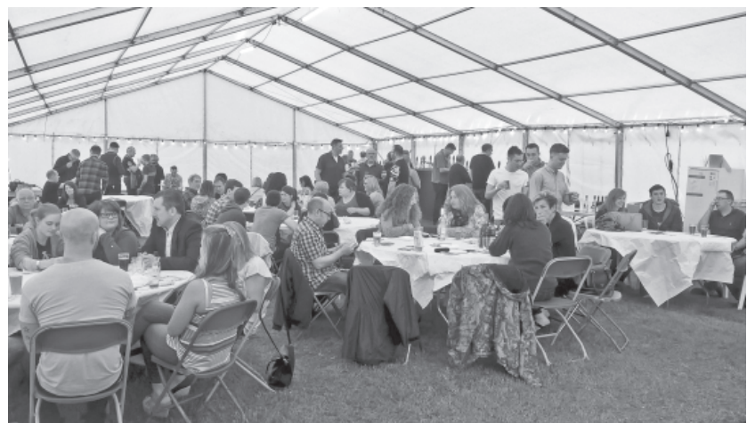
Visitors making good use of the refreshment tent.