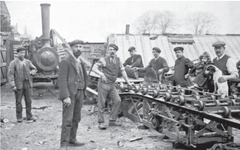
Buckham's Sawmills, a Lanchester family business. This photograph shows that facial hair is not just a modern trend. Perhaps the flat cap will also make a comeback soon.