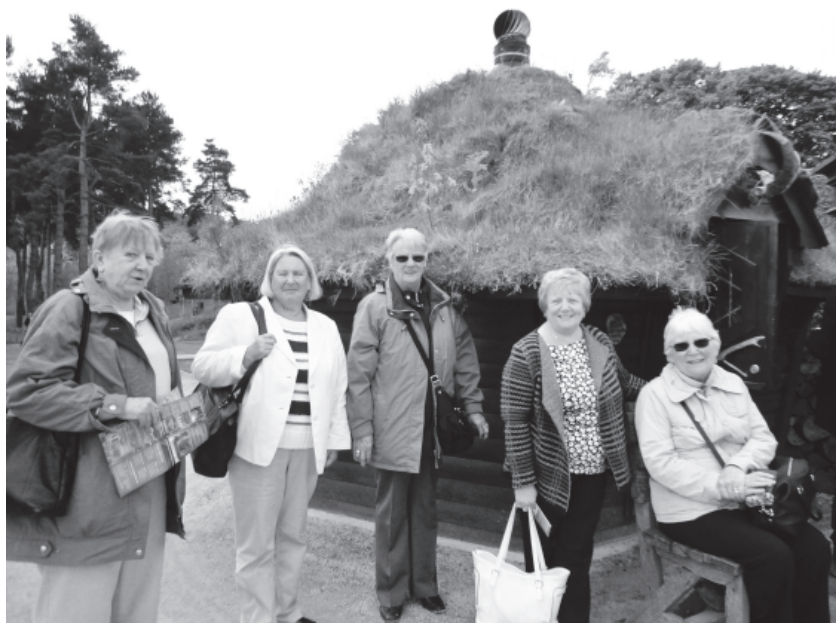
A few Thursday Club members outside Hagrid's hut.

films. There are lots of other parts to explore including a huge walled area, a rose garden and of course, the various eateries. There is somewhere to eat to suit everybody, even down to taking a picnic, but the jewel in the crown has to be the impressive Treehouse structure with its wobbling walkways, Potting Shed cafe and a most individual restaurant. We all arrived home with all our senses satisfied, sight, sound, smell, taste and replete with good company. A good day!