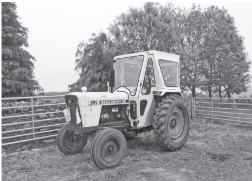
A grand old machine.