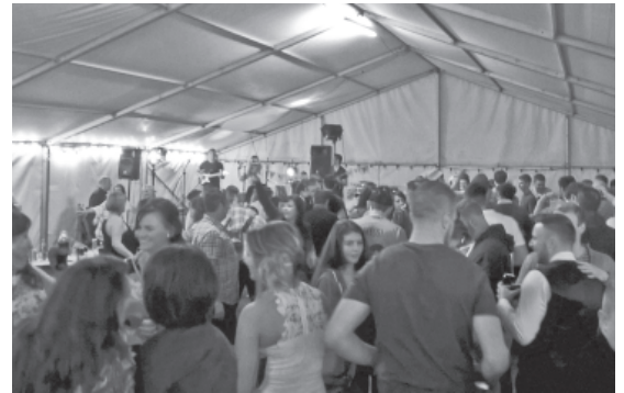
Dancing to the Pretty Weeds.

local off licences for cans to keep the crowd going. The Police played their part in keeping the party goers quiet as they left and hopefully any disturbance was minimised. A big thank you to those who contributed so much hard work over five days to make this event such a success.