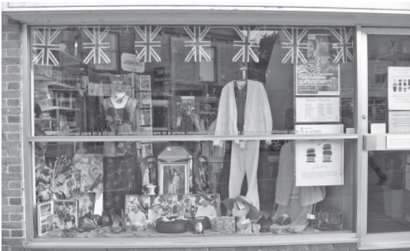
A superbly dressed window at the Red Cross Shop to celebrate the Queen's 90th birthday.

Wear Smart n Spray Mobile Paint, Body & Trim Repair