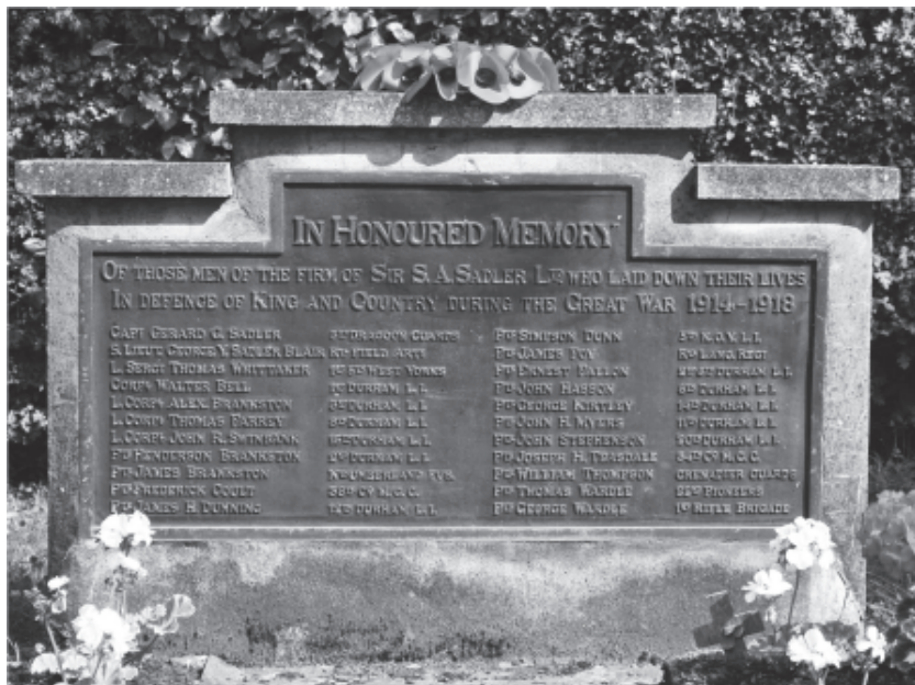
The WWI Memorial at Malton Colliery.