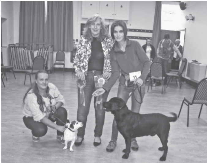
The Best in Show and Reserve at the Dog Show. See page 14.