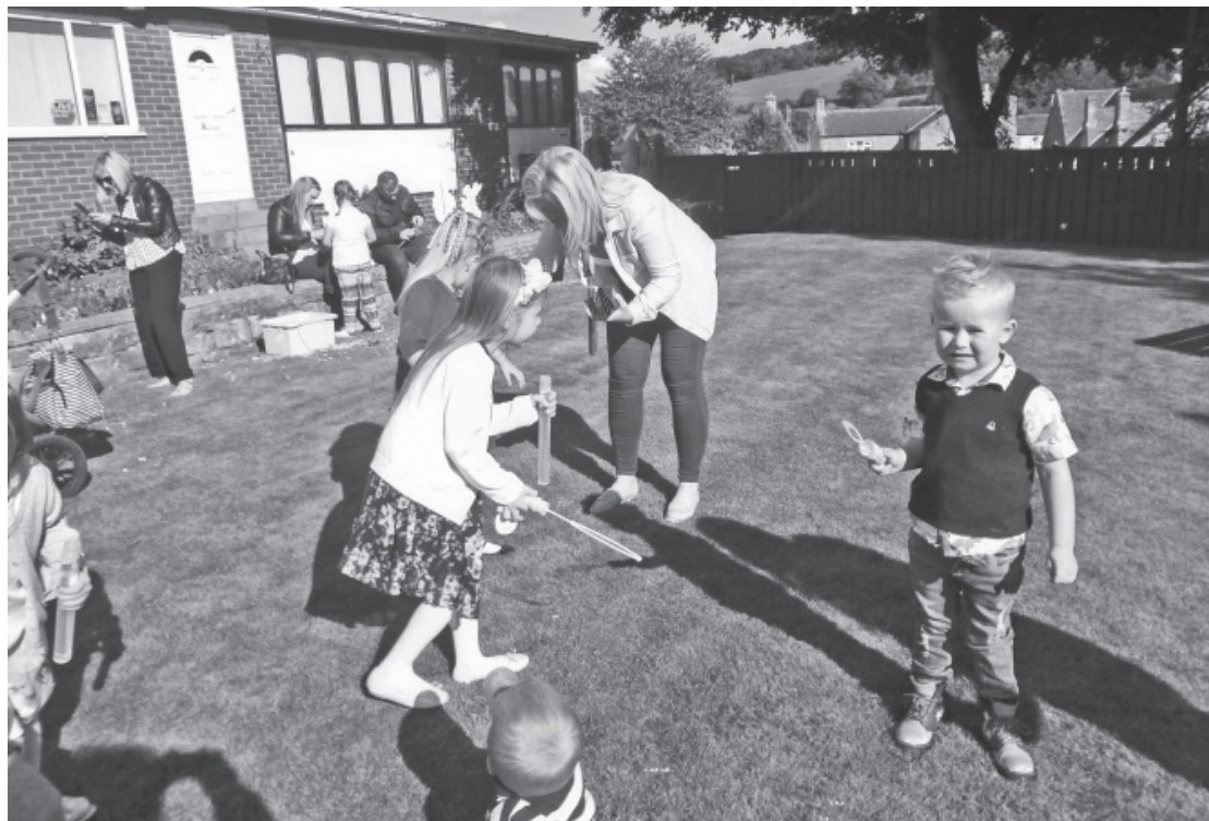
Fun in the sun-blowing bubbles.

Sunday October 2nd was a beautiful autumn day and local children were thrilled to meet the famous Peter Rabbit and his friends who came to tea. Over 100 tickets had been sold for the event hosted by Willow Burn Hospice. Lanchester Social Club donated the venue. Mr McGregor was on hand to help the children plant carrot seeds; there was a raffle, cake stand, craft and toy stalls, a competition to count the watering cans and a colouring corner. It was a lovely afternoon, the youngsters enjoyed themselves and it was a fitting celebration of Beatrix Potter's 150th birthday.