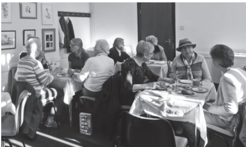
We held another popular Coffee Morning in October.