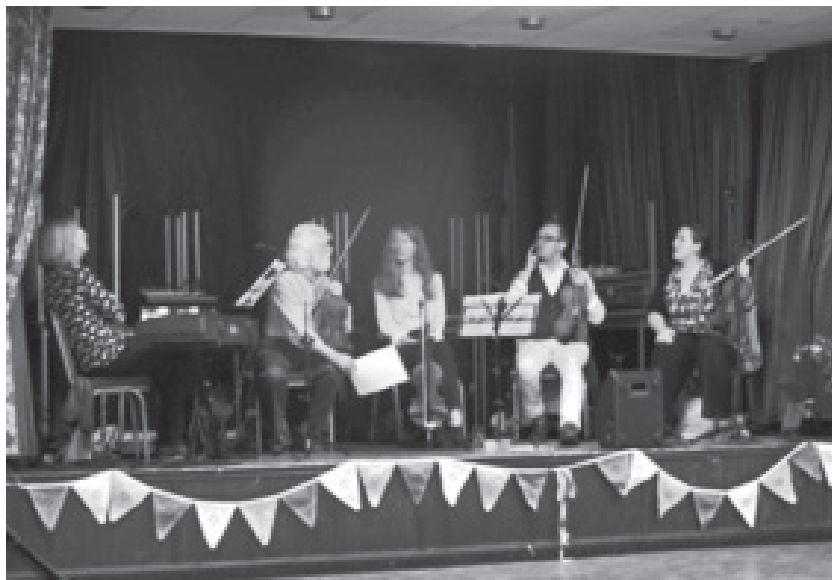
'Windy Gyle' Ceilidh Band