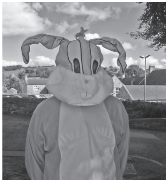
Peter Rabbit meets his young guests.