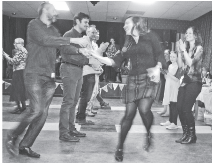
Dancers enjoying Lanchester Partnership's Ceilidh. See page 15.