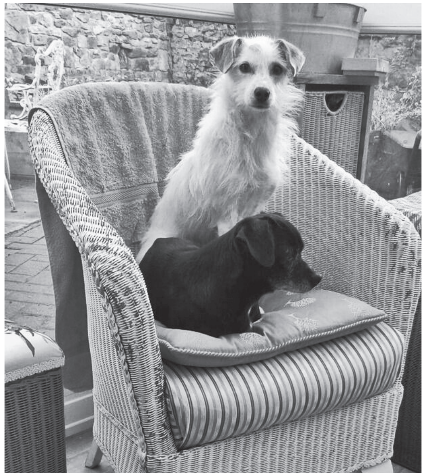
Kit and Minnie in Maureen's lounge.

Anyone interested in fostering or rehoming a dog can contact Tracey at Tendercare on 01207 5229233 or 07982005429.