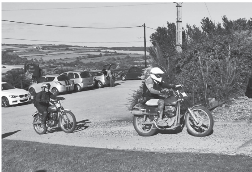
Two of the later starters arriving at the finish.

This ever popular event in the vintage motorcycle calendar is now in its 44th year and continues to attract motorcyclists from all over the UK, and both this year and last year, one rider from France. The complement of riders was full at 150 again and in glorious sunshine they set off between 8.30 and 9.00 am from The New Board Inn at Esh.