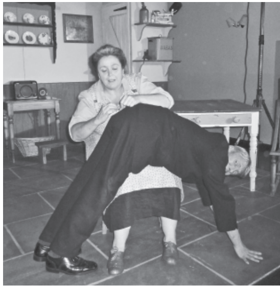
The Reverend Smith in a compromising position as Grace attempts some running repairs.