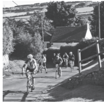
The leaders in 'The Beast' climbing Iveston Bank.

Bank which some have to partly walk. Riders then cross the A691 through Bogglehole, on to Knitsley towards the A68, taking in