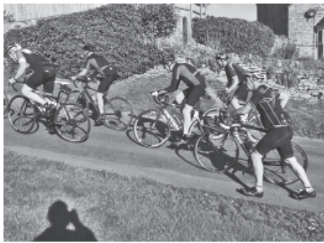
Riders climbing Iveston Bank, a real challenge!

The Beast is an appropriately named tough ride for people