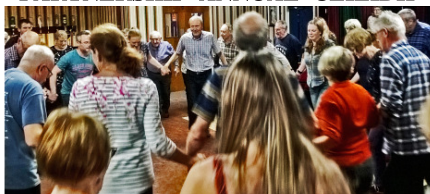
The annual ceilidh organised by Lanchester Partnership in the Social Club with the Windy Gyle Band was a great success. See page 5.

Published by Lanchester Publications Ltd, 2 Fenhall Park, Lanchester, DH7 0JT and printed by Durham County Council, Design and Print, Comeleon House, Tanfield Lea Industrial Estate North, Stanley, County Durham, DH9 9NX.