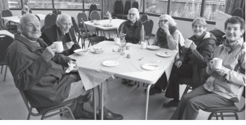
Customers enjoying their lunch at the Canny Café.

The next 'Canny Café' opening will be on January 16th, 2019.