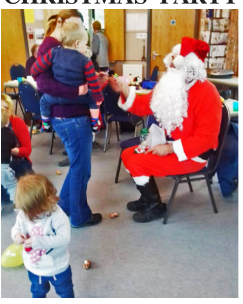
Santa was in great demand at the Christmas Party in All Saints' RC Parish Centre. Story on page 4.