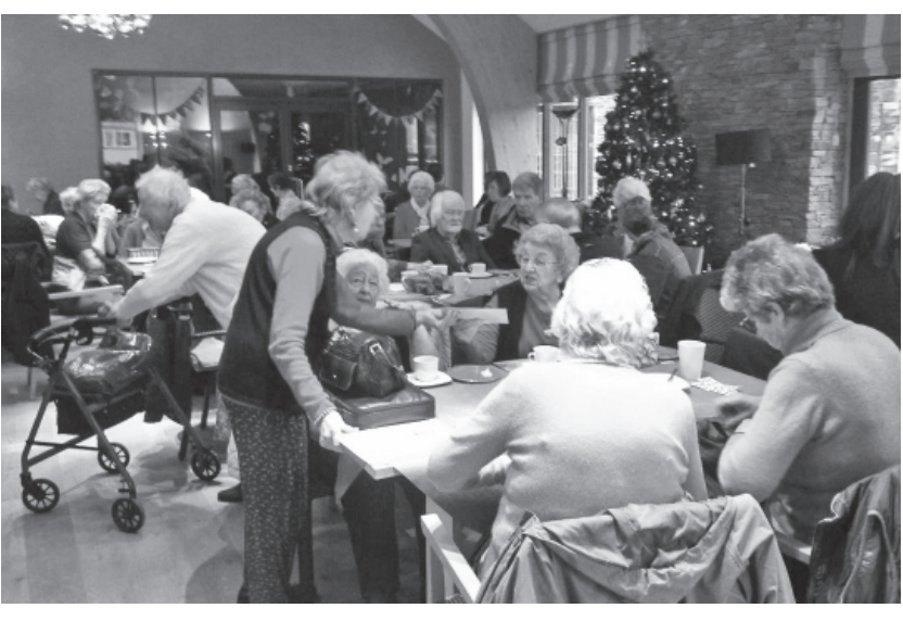
The very popular lunch for the Village Bus.