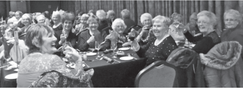
Happy Christmas revellers at Ramside Hall.

Christmas crackers and a booklet of gift vouchers for everyone. Poppers popped, crackers pulled and hats on we were now ready to party. The meal was 2 course and the main was chicken supreme with all the trimmings. It was beautifully presented, served hot (not lukewarm) and delicious. Pudding was chocolate torte with winter berry compote and cream and for those who were not chocoholics an alternative of lemon