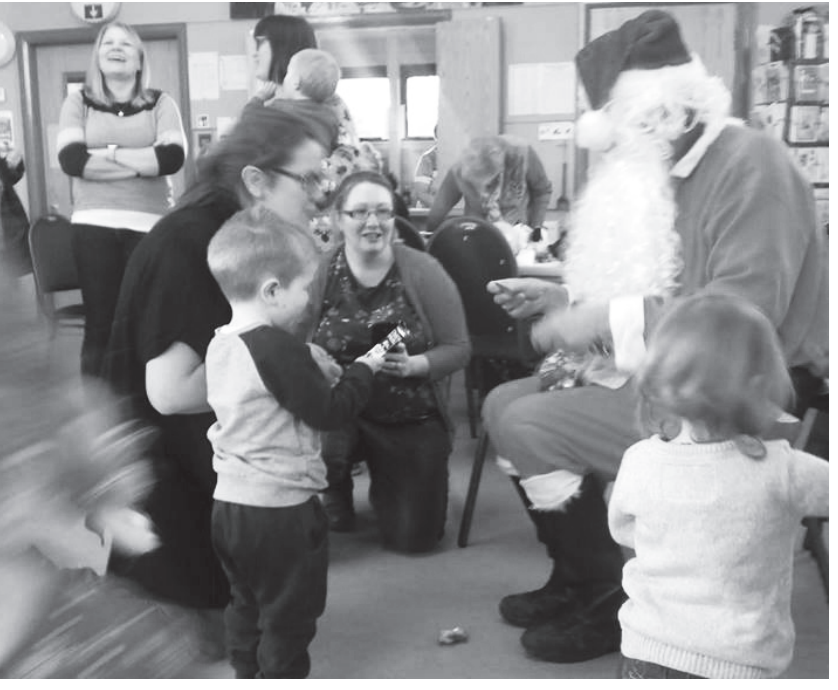
Santa made an appearance at the Cuppa and Chat party. See also photo on back page.

the children's with their toy making. Cuppa and Chat meets on Tuesdays during term time in RC Parish Centre musical bumps and a Lapland to check that the Christmas to one and all from all at Cuppa and Chat.