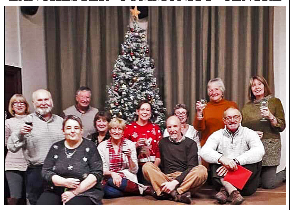
Your Community Centre Management, Staff and Volunteers would like to thank you and wish you a very Happy Christmas and a brilliant 2019. See page 9.