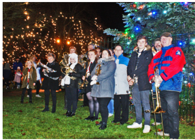
Members of Lanchester Brass Band who played carols and accompanied Lanchester Choral Society for the big Switch On. See story page 3.