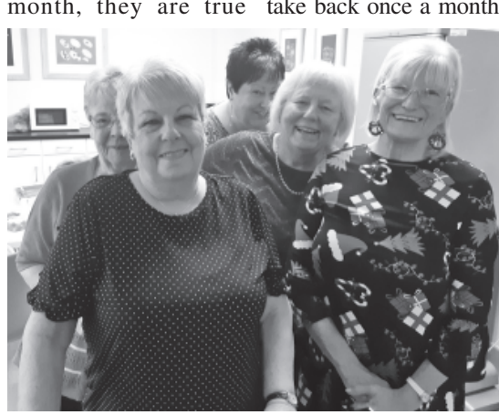
The 'Angels' who work so hard at the lunches.

we would ask that if you contribute, please give generously. The under 14s are playing in an indoor 6-a-side tournament at Chester le Street Riverside and had an exciting tie with Willington to start, both teams making 111 in their Practice nets won't start