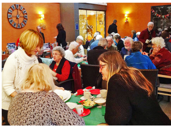
A well attended lunch in aid of the Village Link Bus with plenty of chat and lots to eat took place at Lynwood House. See page 5.