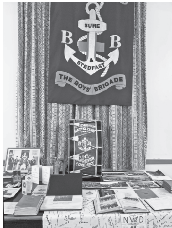
Boys' Brigade memorabilia on show at their 90th anniversary celebrations.