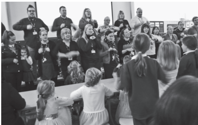
Everyone was served a chocolate drink topped with marshmallows while listening to the teachers singing.

I wonder if the title makes your mouth water and you think - Delicious! Well that was the opinion of all the parents, teachers and