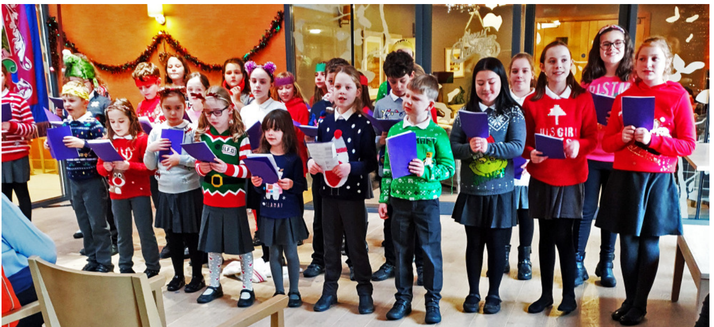
The students from All Saints' Catholic School delighted both the residents of Lynwood House and the Musical Memories group with their selection of Christmas melodies.