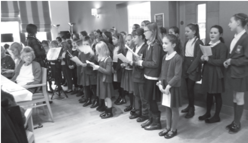
The choir singing beautifully.