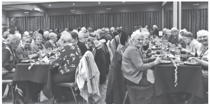
Thursday Club members enjoying their Christmas Party at Ramside Hall.

In December 2018 we had our Christmas Party at a Ramside Hall Lunch Event and enjoyed ourselves so much that we decided to repeat the experience in December 2019. So on 12th December, a bitterly cold morning, we set off another entertaining afternoon. We were not