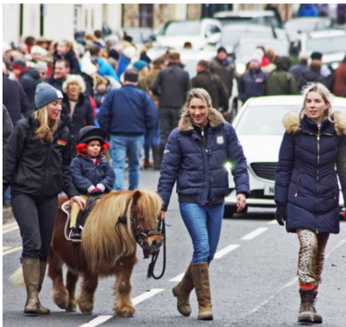
Probably the youngest rider at the event.