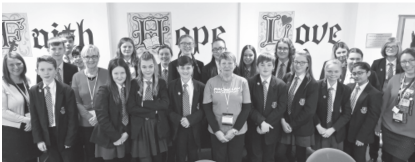
Some of the St Bede's students with the charity representatives.

The prophet John the Baptist fired the imagination of the people, they came from all over to hear him. There was a stir going on, a sense of something important. An urgent message about the Kingdom of God. "What must we do?" they asked him. His answers give us a glimpse of the message of Jesus: "Share what you have with the needy, always be honest and treat others with Love." The students lived out these words during the Season of Advent and completed their Advent