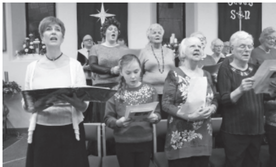
Beautiful singing by the choir.