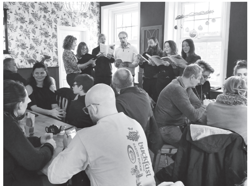
Ushaw College Choir entertaining customers at Quebec Tearoom.

from Ushaw College and their wonderful versions of the old favourite tunes brought a warm, happy atmosphere to the crowds of local people enjoying the Christmas event.