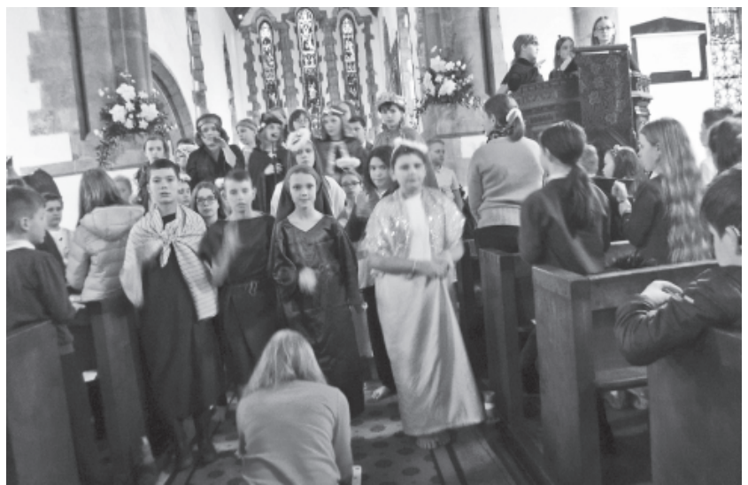
Year 6 Nativity in the Parish Church.

There was some lovely singing in which all the pupils took part and some solo singing which was really beautiful. At the close, Year 3 took over with their procession of Christingle Oranges. The oranges are