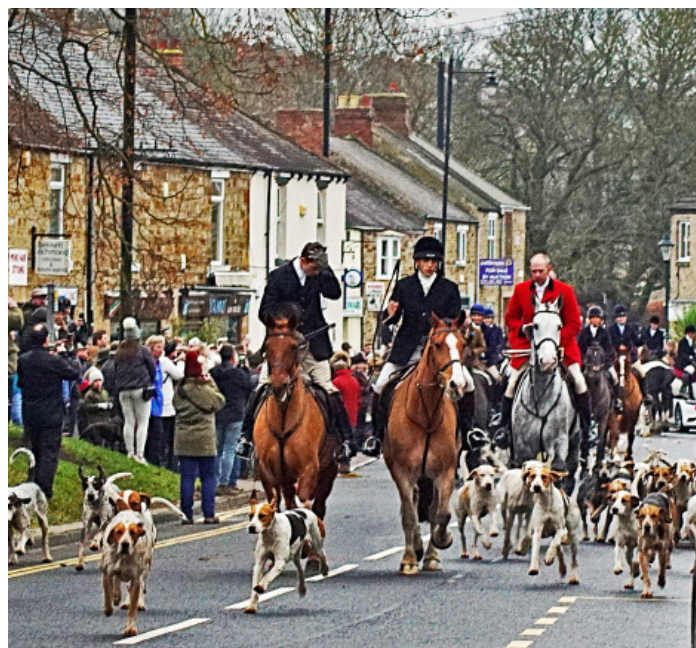
Moving through the village at the start of the hunt.

Hundreds of locals - young and not so young - turned out to see the traditional Boxing Day hunt in Lanchester's Front Street.