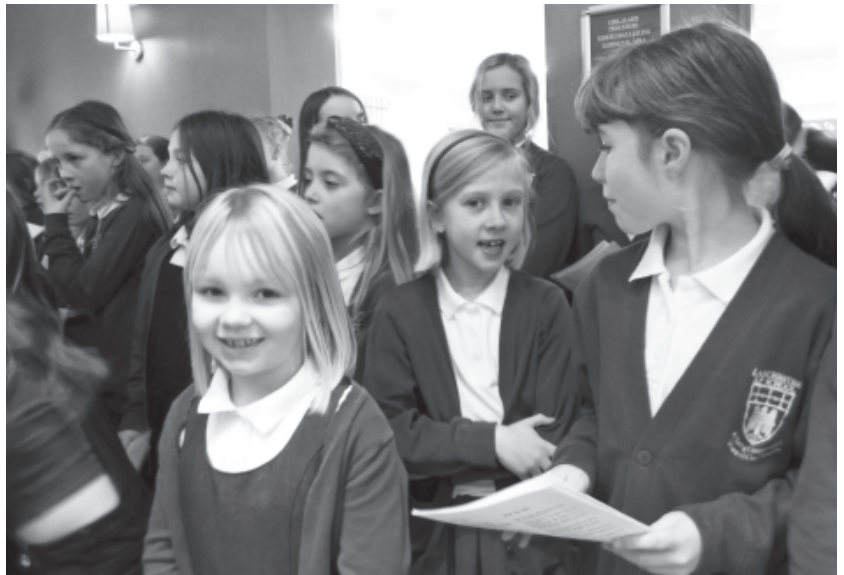
The choir preparing to sing at Lynwood House in aid of the village bus.

After everyone had eaten, the school choir arrived to give their seasonal concert and their performance was once again delightful. They all looked so happy and this was infectious because there were many smiling faces in the audience. The EP School choir and their conductor have certainly spread a great deal of