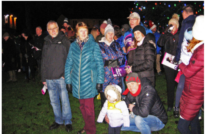
A small crowd scene from the very large number of people who attended. Article on page 2.