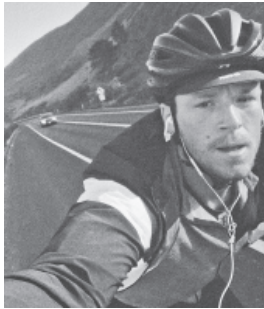
The face says it all - a long day.

The exact date, time and starting point will be posted on Lanchester Past & Present Facebook, my Facebook page and