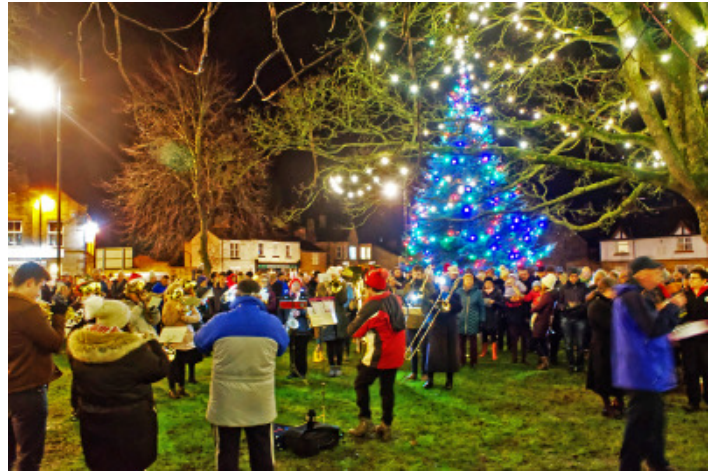
The ever present Lanchester Brass Band.