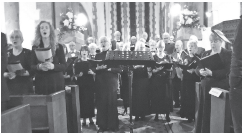
The choirs were in good voice for their annual concert.