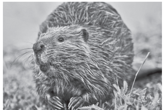
The Eurasian beaver is actually native to the UK.