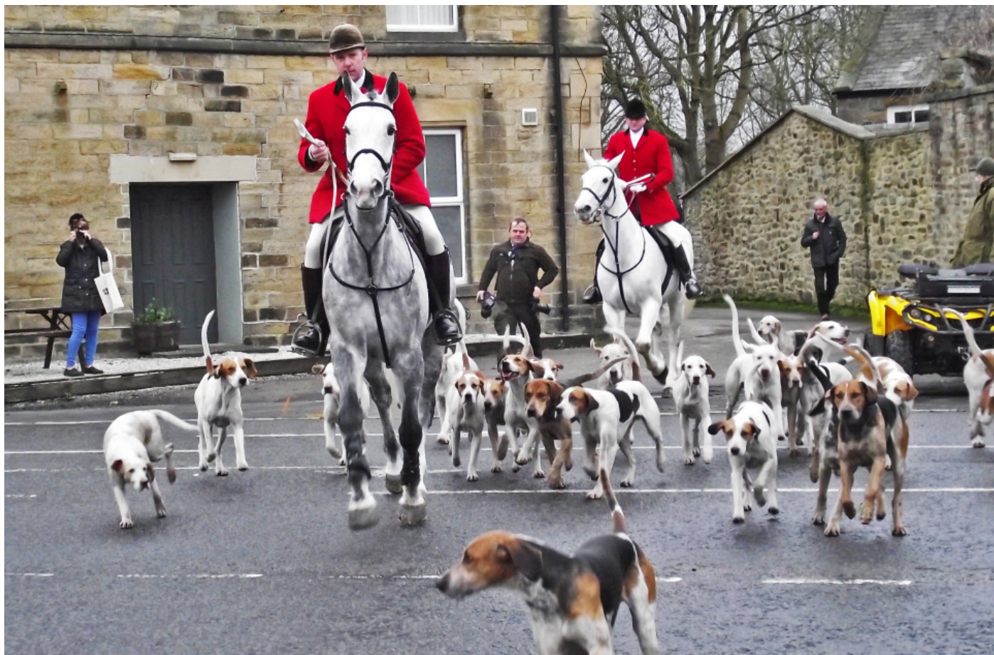
Huntsmen and hounds leaving the King's Head car park.