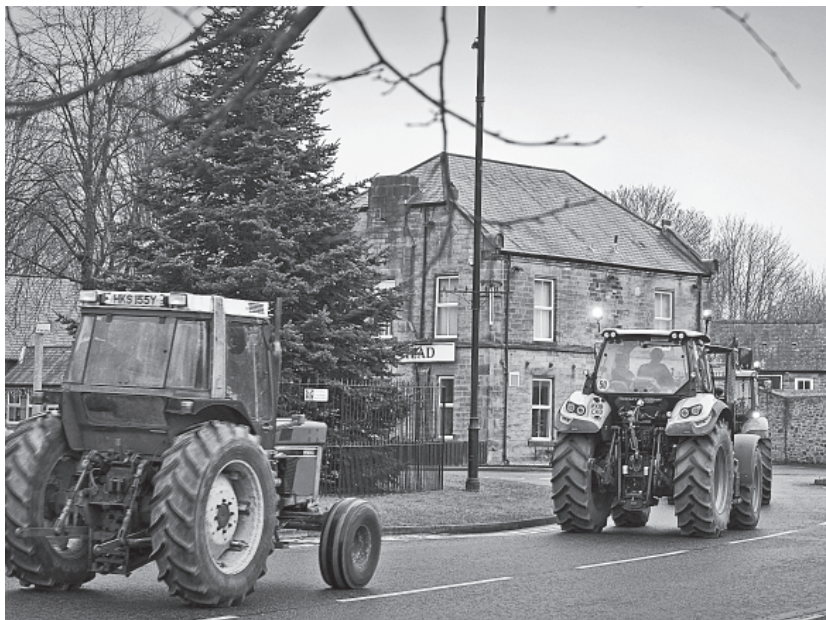
Vintage Tractors processing toward the King's Head at the start of their Boxing Day Run.

1-2 Front Street Lanchester 01207 520331