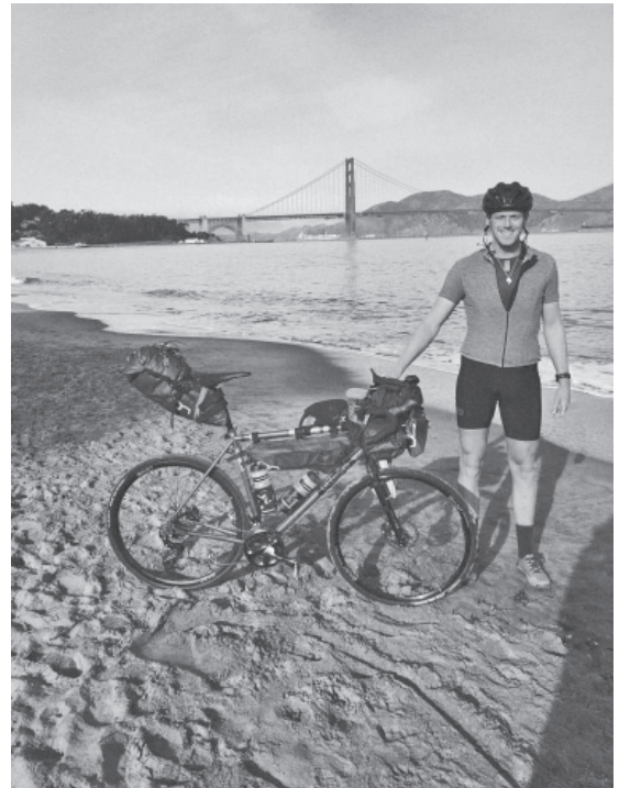
San Francisco - Jacksonville/Florida. Coast - Coast Challenge: Tick.

My experience of cycling 2100+ miles around the world has been varied but overwhelmingly positive. My belief in the kindness of strangers and the human race in general has been proven time after time - so many doors have been opened to me and I've experienced true generosity, making the hardships of the journey manageable. Likewise, I cannot thank each and everyone of you