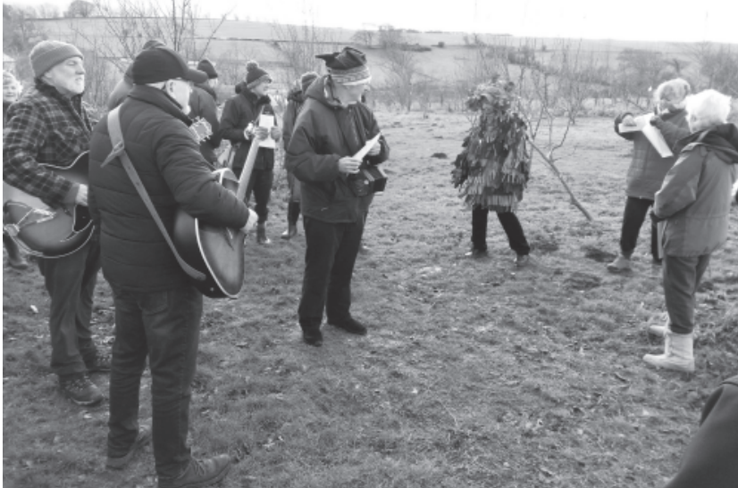
Community Orchard members singing the Wassailing Song to wake up the trees from their winter sleep.

On the windiest day we have seen for some time, a few hardy souls gathered at Lanchester Community Orchard for the first working day of the year. We completed tasks of pruning apple trees, blackcurrant and redcurrant bushes, and digging over plots in preparation for the new season, whilst being severely lashed by 50mph winds. After half an industrial sized box of matches we managed to get a respectable bonfire going, which under gale force conditions rapidly consumed all six barrow loads of twigs and branches.