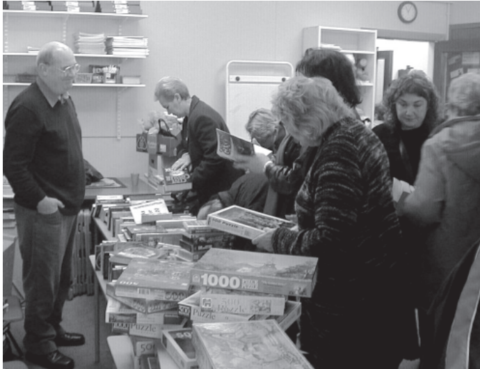
The book stall at the Willow Burn fair

School. The sum of £3890 was raised, £1000 more than last year. Many thanks to all who contributed.