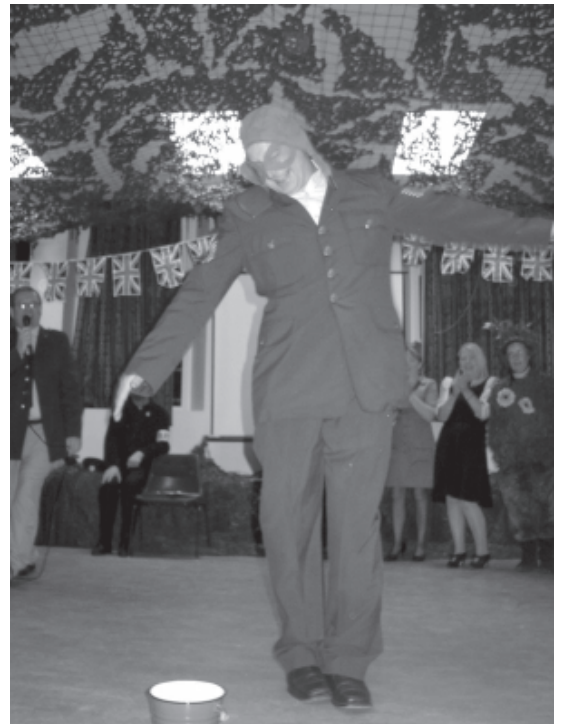
To the tune of the Dam Busters March, another plane comes in to bomb the bucket