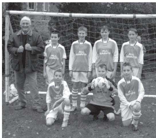
The All Saints' team show off their new strips

who owns Hart Engineering, is pictured below with the Y7 pupils in their new green and white kit with the school name emblazoned on the front.