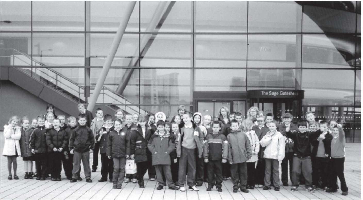
All Saints' Primary School children at The Sage Gateshead

There was a definite nautical feel to the air when pupils of year 4, 5 and 6 in All Saints joined hundreds of other children at the Sage