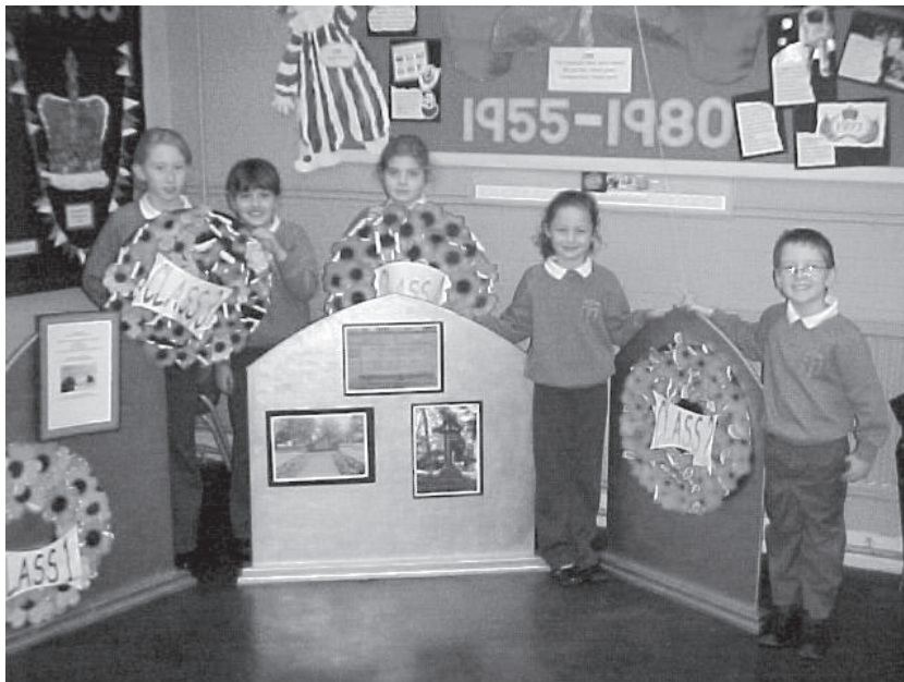
Some of the children who placed wreaths