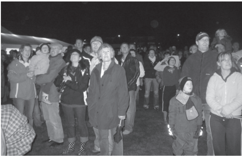
The crowd is lit up by the bonfire and another barrage of fireworks