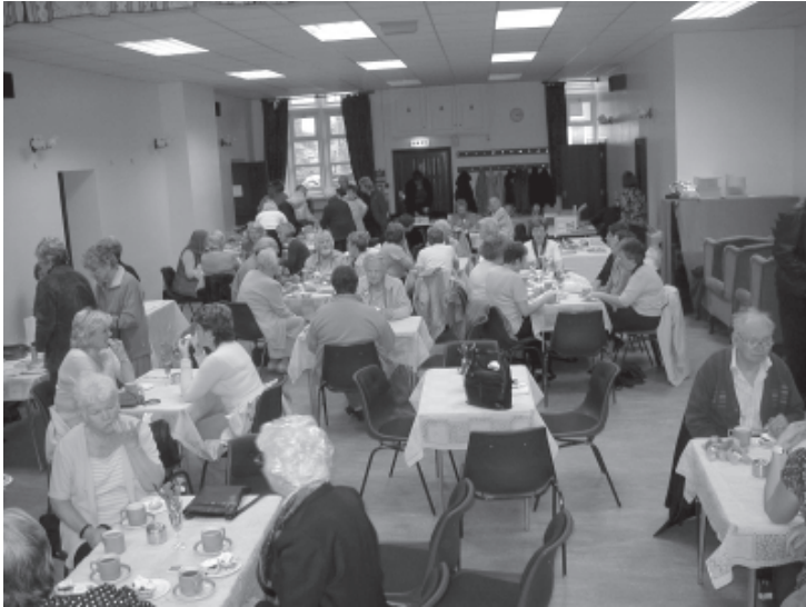
A packed Community Centre enjoying their Cream Tea organized by Lady Lions in aid of Willow Burn