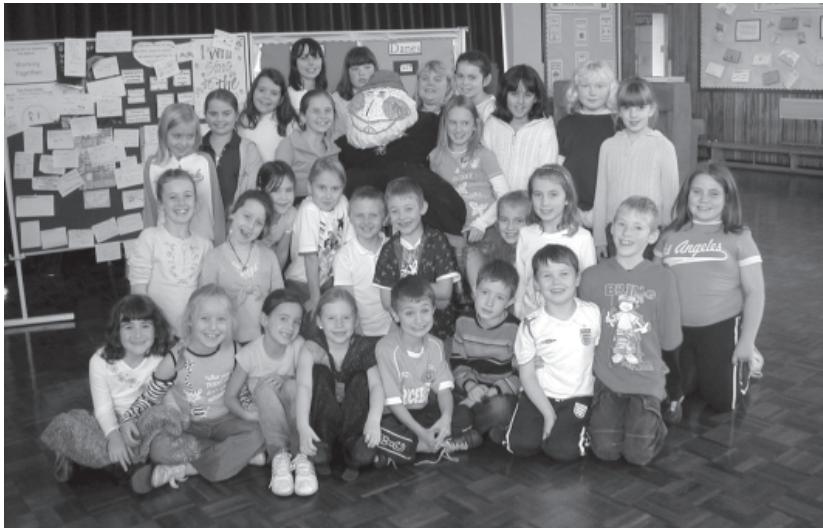
Members of the Art Club at Lanchester EP School who made the Guy for the 400th Anniversary of the Gunpowder Plot