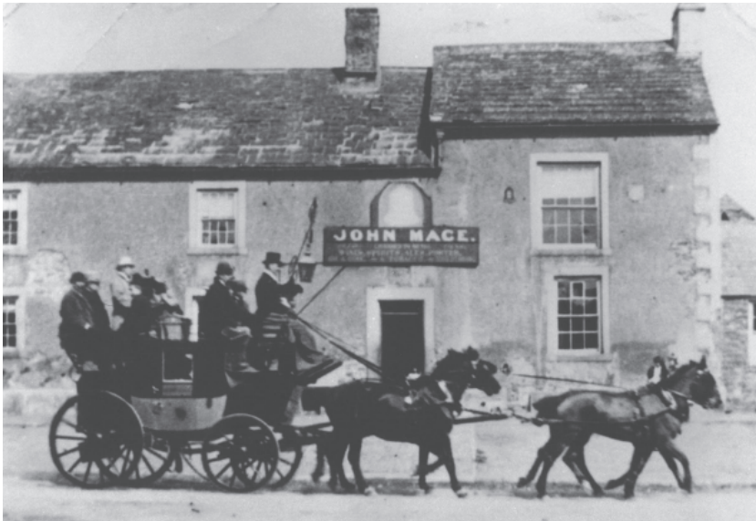
One of the old photos in the new DVD shows the Venture coach in front of Blue Bell, later the Lanchester Arms

The DVD costs £12.99 and can be purchased at Northpoint Multimedia at Shotley Bridge, Lanchester Library, Lanchester Newsagents and Matthews Home and Country shop.