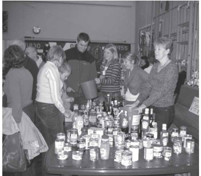
A popular tombola at the Willow Burn fair