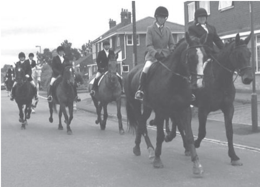
Opening day of the hunt season sees Braes of Derwent Hunt storming up Kitswell Road