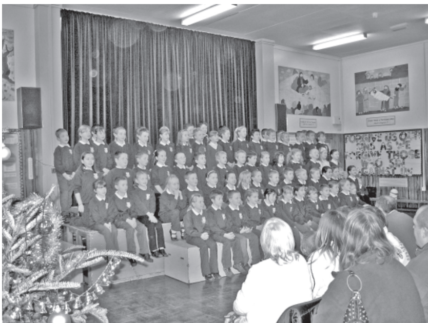
Lower Juniors E P School performing at the Concert and Coffee Afternoon