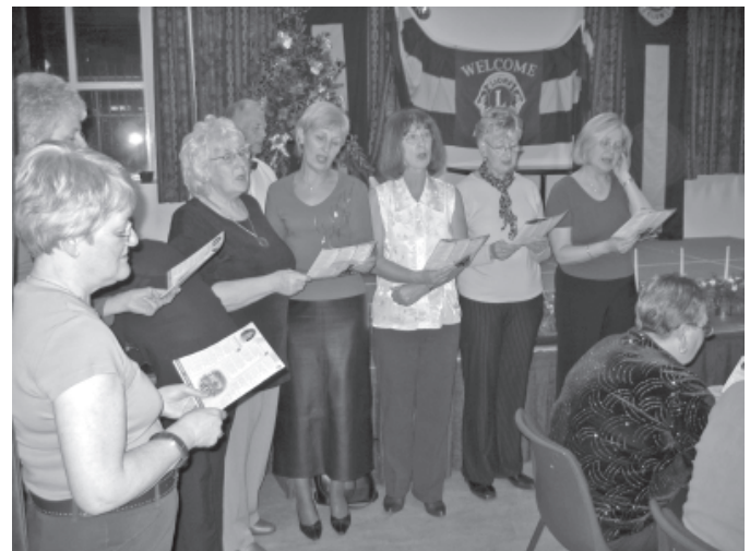
The melodious Lady Lions leading the carol singing