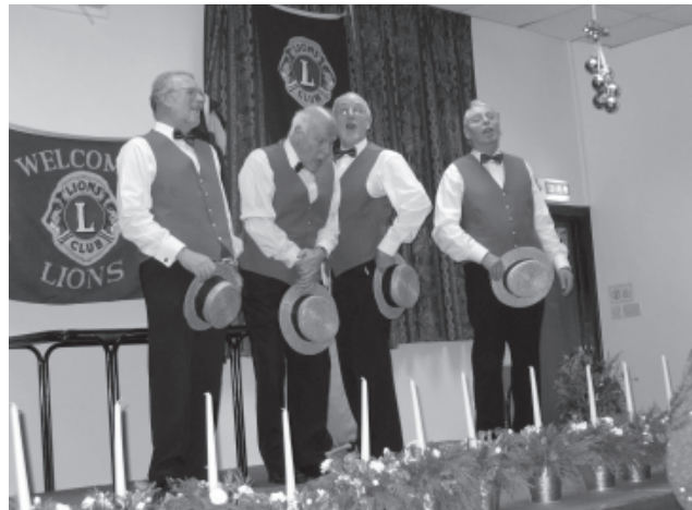
The Lantones Barbershop quartet enjoying the evening as much as their audience