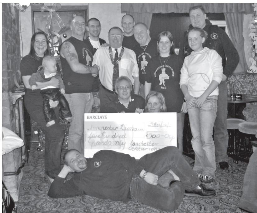
Members of Lanchester Centurions in party mood after the presentation

parties, the money from the Centurions will go a long way to off-setting those costs. The Lions Club is extremely grateful for this very large unexpected donation. Likewise, the Centurions would like to express their thanks to all the people who have given so generously to all their fund raising efforts, and particularly The King's Head, The Queen's Head, the Black Bull and the Social Club for donating prizes and generally supporting the club in their events.