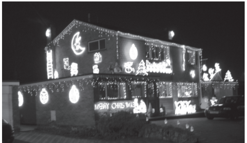
Delightful display at Deanery View