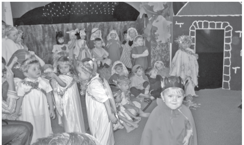
A crowded set as children enjoy their Nativity – 'Donkey for Sale'