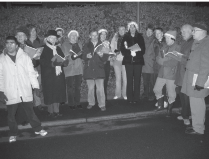
Members of the Choral and Operatic Society singing carols around the streets of Lanchester