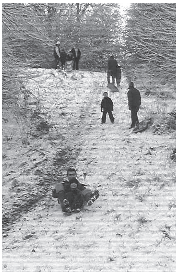
The hillside from the railway down to the play area was an ideal place for young sledgers and their parents to test-drive their winter vehicles