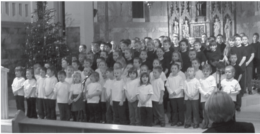
Children of All Saints' RC Primary School at their carol concert