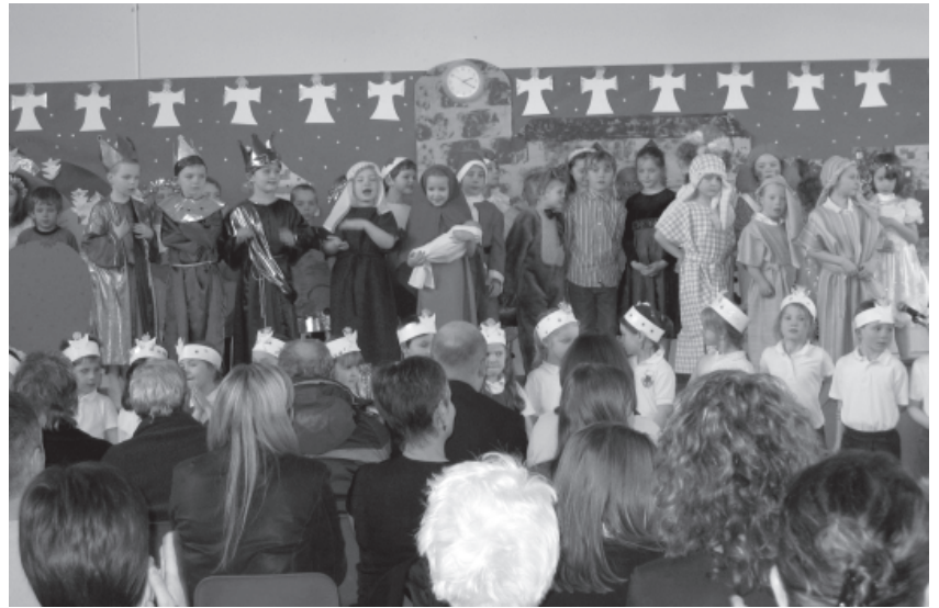
The infants perform at the EP school's concert and coffee afternoon

and interspersed with their readings, various other groups of children sang or spoke on stage dressed as Christmas Toys, Seasonal Food, Snowflakes, Angels, Shepherds, Kings and, of course, there was Mary and Joseph. It was very enjoyable to watch, also to listen to and there was also a glass of wine or orange juice plus snacks for those who wished to join in the seasonal spirit.