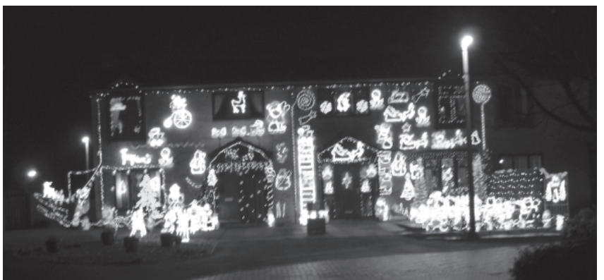
Even more features have been added to the display at Valley Grove

at the January meeting of Lanchester Partnership. It was decided to write to the Council expressing disquiet that the opinion of the District Council and other groups had been ignored, particularly in view of Hurbuck site being put forward in the County's Minerals Plan.