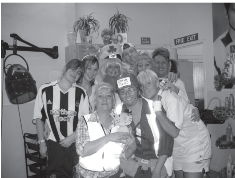
Staff at New Image really go to town on the fancy dress costumes for Christmas Eve