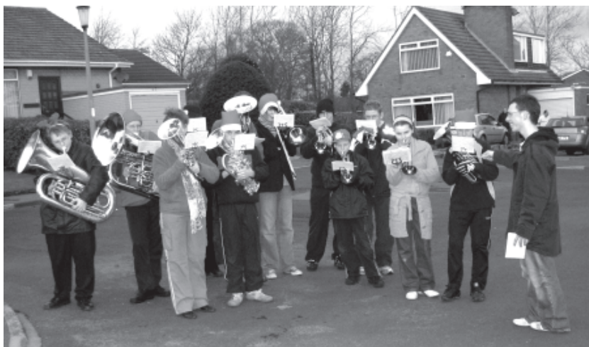
Lanchester Brass Band playing carols around the streets of Lanchester

The Brass Band plays a major role in the village, performing without payment at many events like the Carnival and Remembrance Sunday. They also maintain a Training Band which enables many young people to learn to read music and play an instrument.