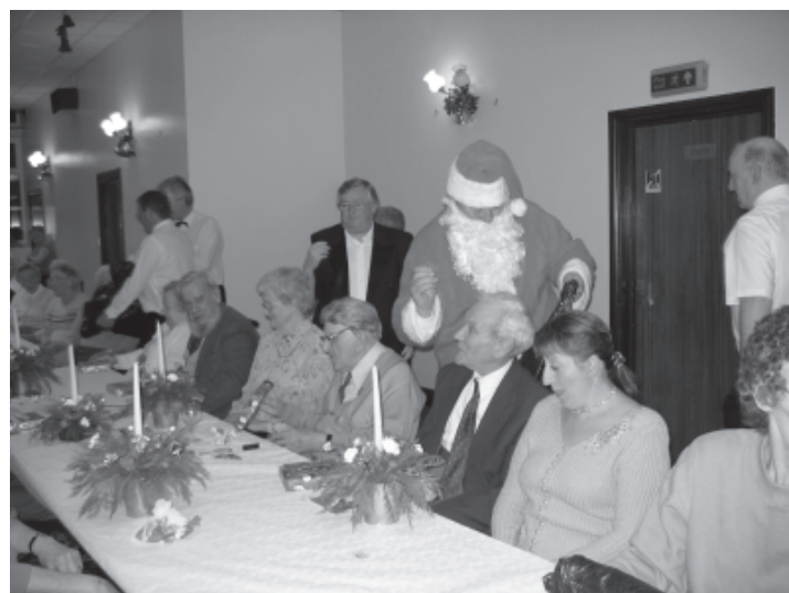
Santa giving out presents at the end of the evening