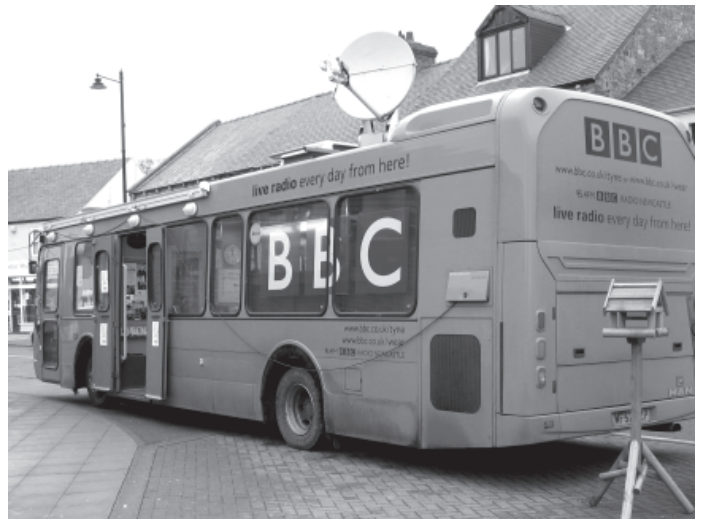
The BBC Blue Bus – parked outside New Image on 9th January