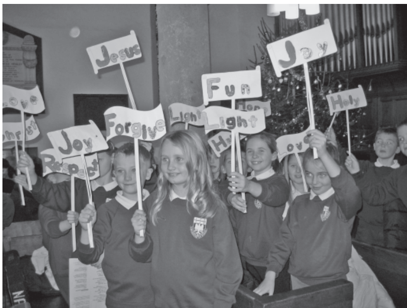
The junior EP school carol concert included Christingles and banners, seen in our photo, to convey the Christmas message

Lanchester E P School held a Concert and Coffee Afternoon towards the end of the autumn term which attracted a completely full hall of parents and friends. Those who attended were able to relax with a cup of tea or a cup of coffee as the children performed their concert of mainly seasonal songs and carols. Taking part were the Upper Juniors, Lower Juniors, School Choir and Infants. The songs and the carols ranged from a mellow but melodious 'You are my Sister'; to a lively 'Hosannah Rock'; interspersed with the School Choir rendering a lovely alternate version of 'Away in a Manger'. The little children ended the concert with a Christmas party atmosphere as they joyfully sang a selection of children's favourites; these included 'Jingle Bells'; 'When Santa got stuck up the chimney'; and their finale, 'We wish you a Merry Christmas'. At the end the audience burst into rapturous applause and much to their delight children were allowed to leave school a little earlier than usual. A magnificent total of £163.72 was raised and thanks are due to all who helped at the function.