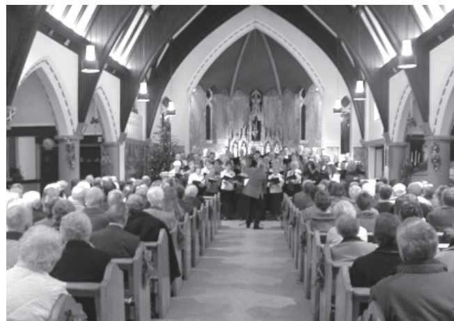
A packed church listens to the combined Operatic and Male Voice choirs

The 2005 programme on December 19th, held in All Saints' RC church, was a classic with both groups in good voice offering a varied selection of carols. Outstanding were the