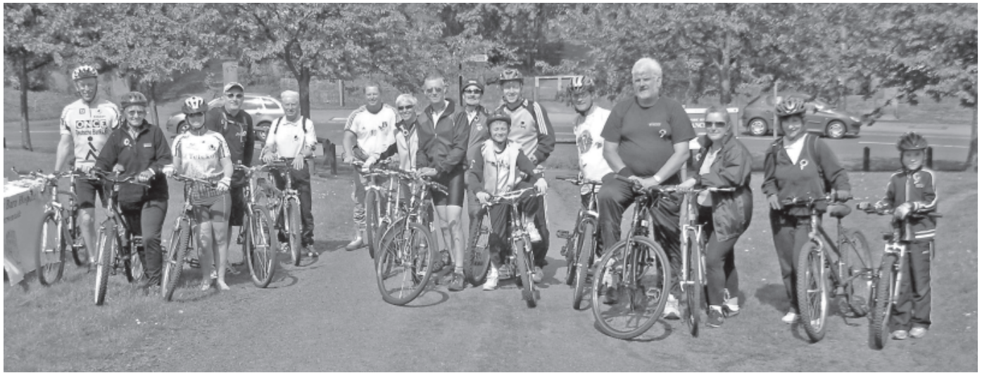
The start of the bike ride to Broom Park and back, which raised over £1000 for Willowburn Hospice.