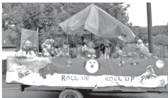
Playgroup float with gorgeous costumed passengers