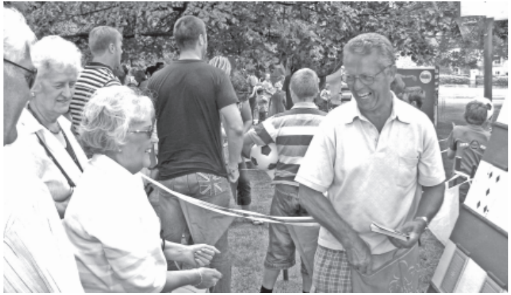
A happy winner at the card game