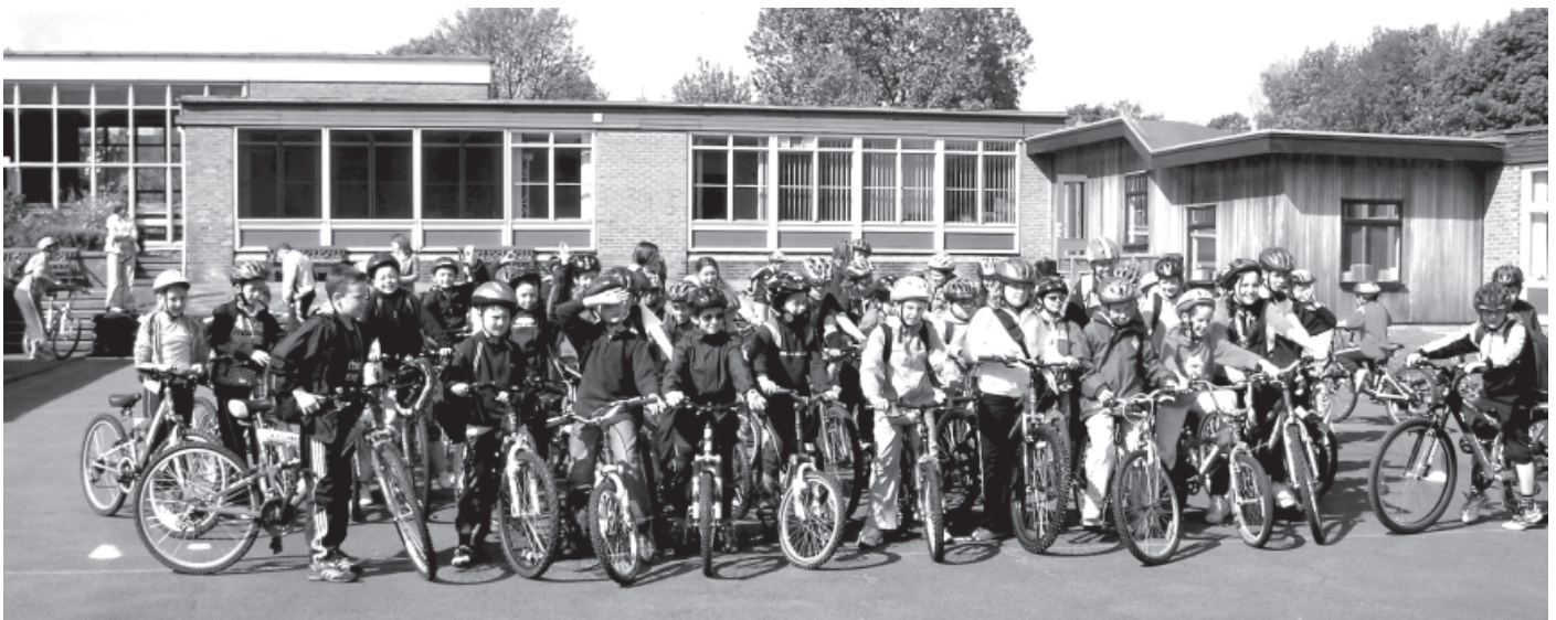
Year 5 and 6 children on their bikes