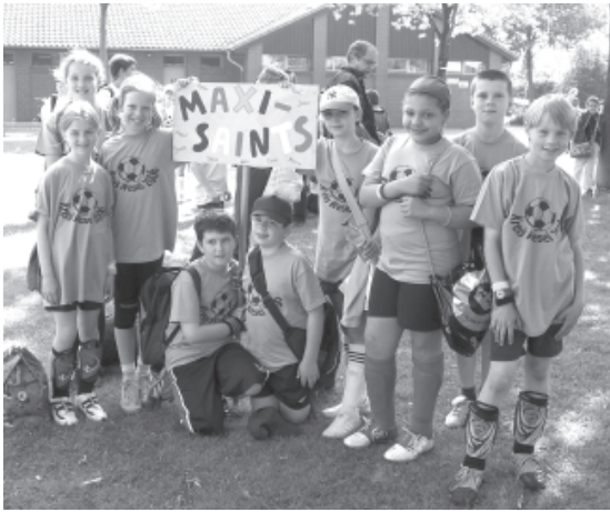
Pupils from All Saints primary school, Lanchester and the Maximilian-Kolbe school, Schermbeck form a joint football team

Five children from All Saints' School have experienced World Cup fever more closely than most of us, as they have just returned from Germany as part of a special Anglo German World Cup Project. This initiative, fostered by the International Relations Department in County Hall, has partnered twelve Co. Durham primary schools with a like number of schools in the Kreis Wesel area of the Lower Rhine, with the aim of promoting good relations