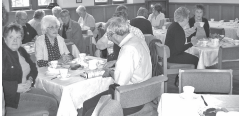
Happy customers enjoy the morning chatting and eating excellent food