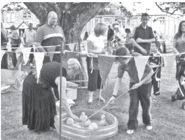
Fishing for Ducks is not as easy as you might think!