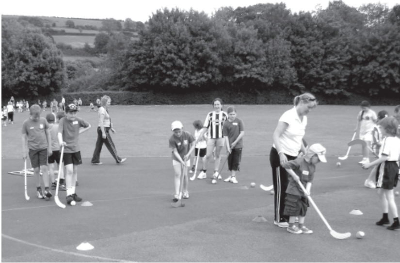
Youngsters try hockey at the sports day

On a lovely sunny June afternoon All Saints Primary, Lanchester EP and some children from Burnhope Primary met at The EP School for a non-competitive, fun Sports Day. Altogether there about 360 children involved and they all seemed to be thoroughly enjoying the occasion. The event was actually part of the EP School Creativity Week which had been postponed because of inclement weather.