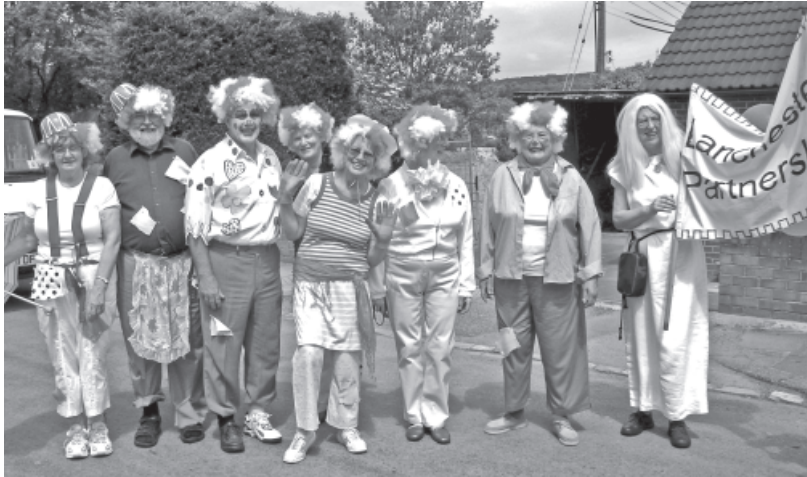
Candidate for the Roman Circus is the Partnership team