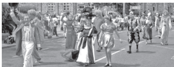
Lanchester Operatic group are the essence of chic