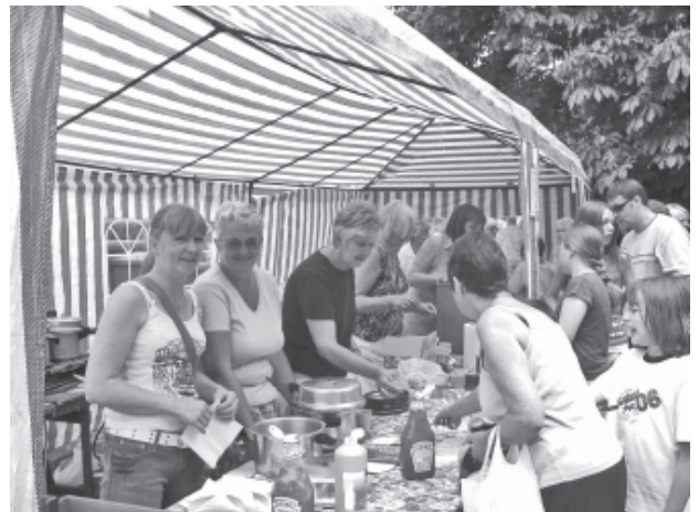
Lady Lions serve hot dogs and ice cream