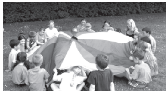
There's a shark under the sea