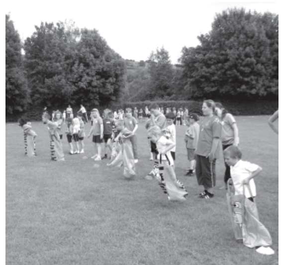
And they're off! in the sack race