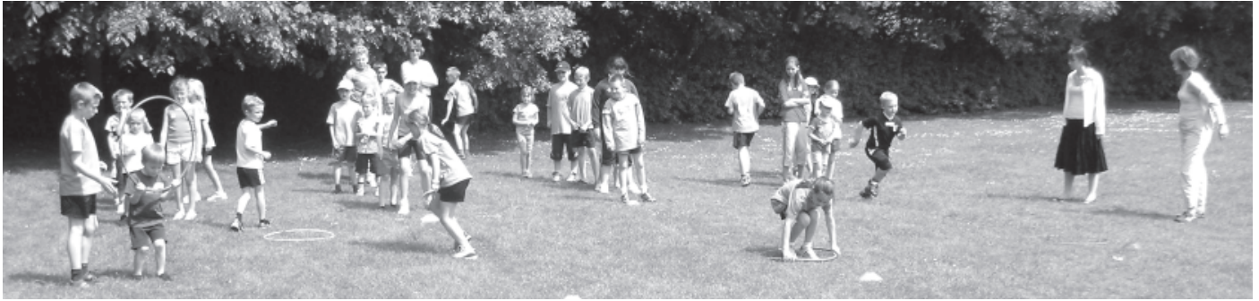
Children having fun with hula hoops