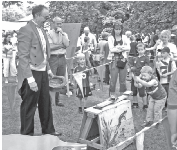
Another frog hops into the pool