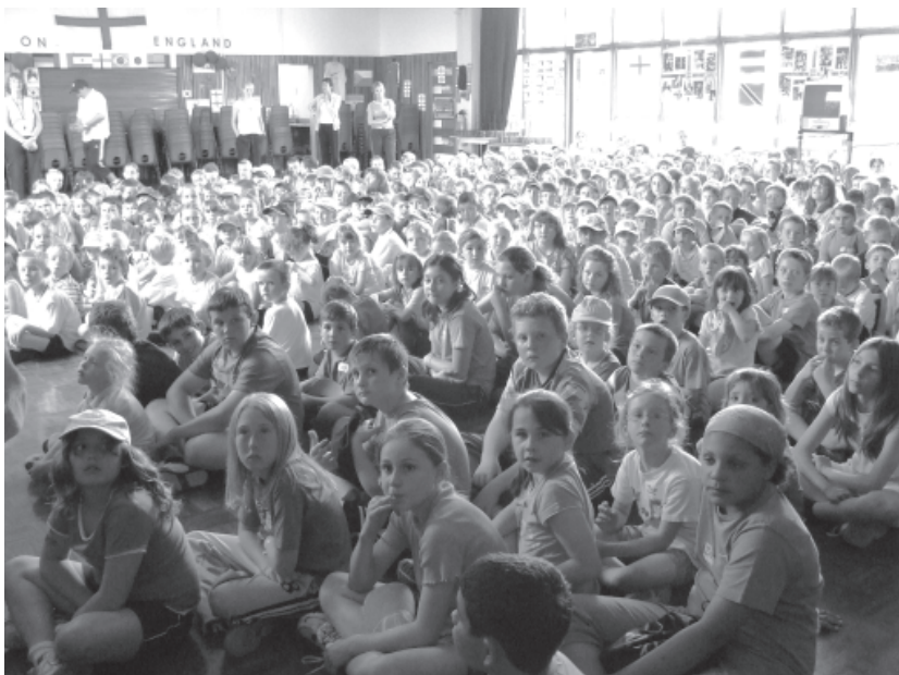
Children from both schools at the presentation