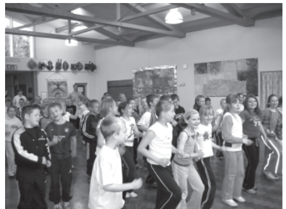
Above: Children and pupils practise warm-up dancing for Freddy Fit