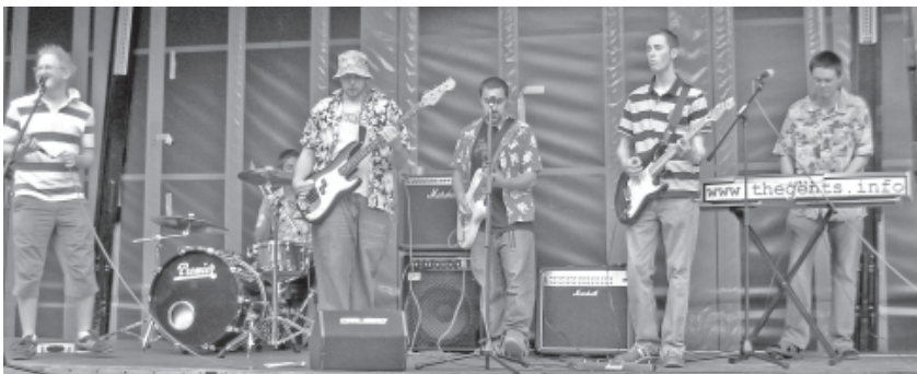
New entertainers were the eponymous Gents