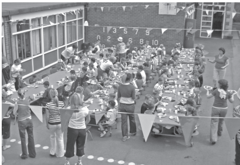
The 'Street' Party at All Saints primary school