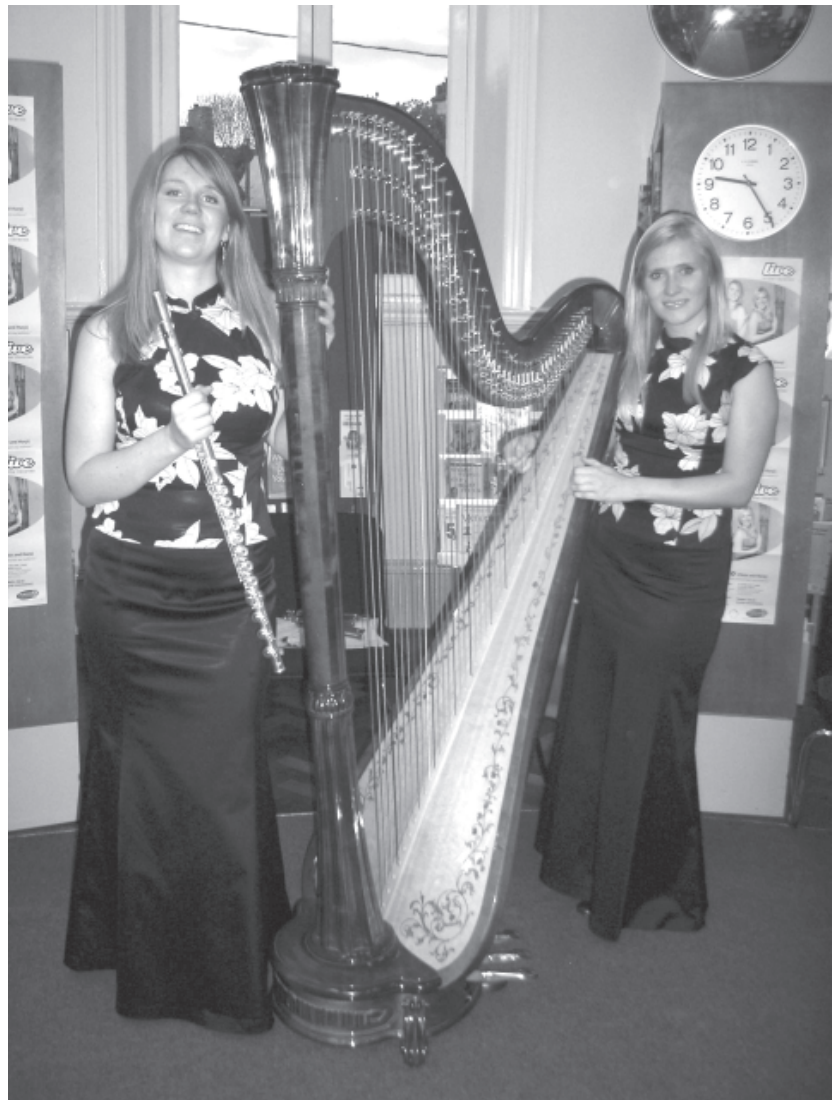
The Aurora Duo in Lanchester library

FOR A COMPETITIVE QUOTE OR FREE ADVICE WITH NO CALL OUT CHARGE CALL BARRY ON 01207 528139 OR 077 17 17 47 39