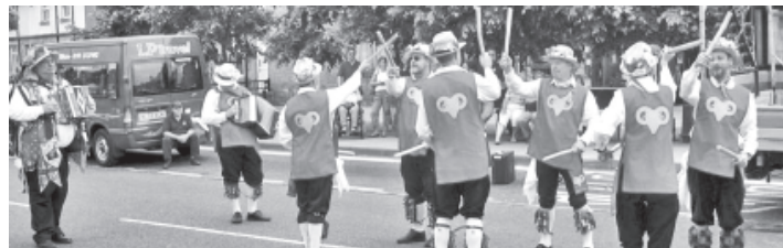
The Morris Dancers entertain along the route