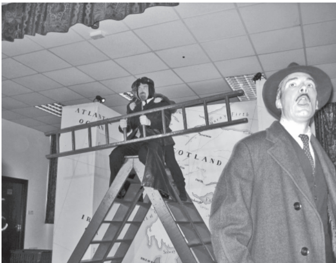
The hero and the villain