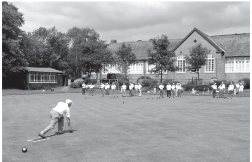
One of Lanchester's skips, Frank Tonks, bowls in the team's 8-2 victory over Leadgate

hoped this far-sighted approach is beneficial to the club at a time when some local clubs are struggling with a drop-off in membership. It is not too late to join the club as bowling goes on to the end of September. For the latest results, see page 19.