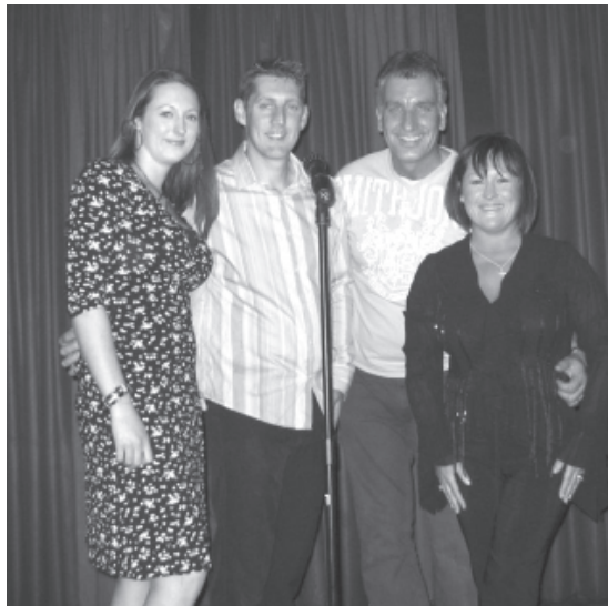
Entertainers at the 'Friends of School' Charity Concert

Black Bull; Davisons Fashions. All those business people who gave raffle prizes, those who helped on the night, and of course, all the people who attended the evening are thanked for their contribution to the event. The excellent total raised was £505.90 which goes into the school fund for development of the outside area.