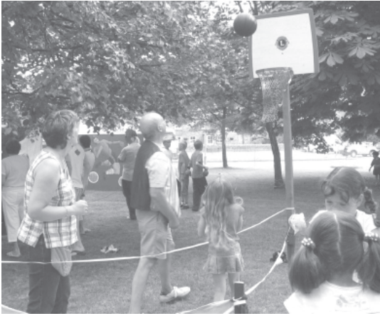
All eyes on a well aimed ball going straight into the basket