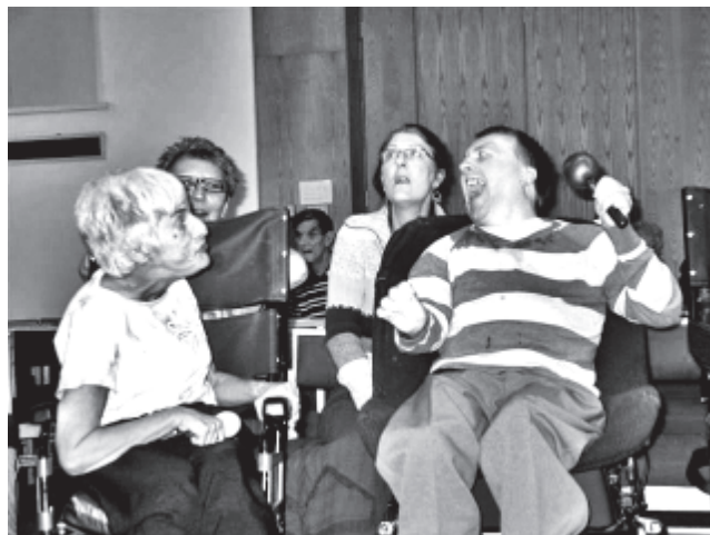
Visitors to the Methodist Church with instrumental backing

actions!) together with a soup and sandwich lunch. It was a pleasure and a privilege to share with them, and we know from what was said by those from the centre and from Church that it won't be a one off!! There will be an encore.