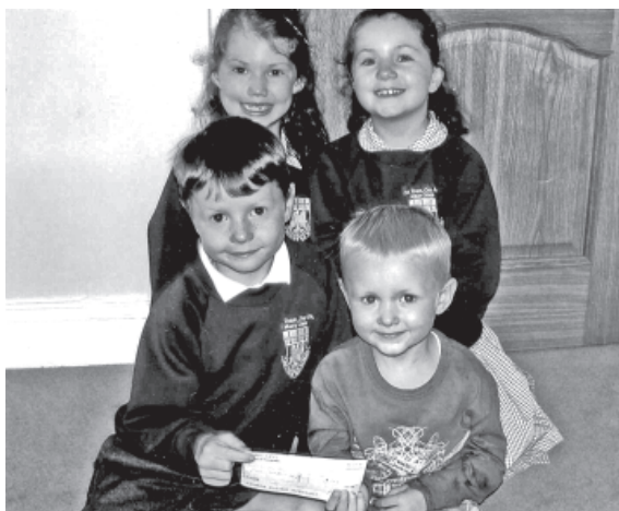
The children hold up their cheque for the camera