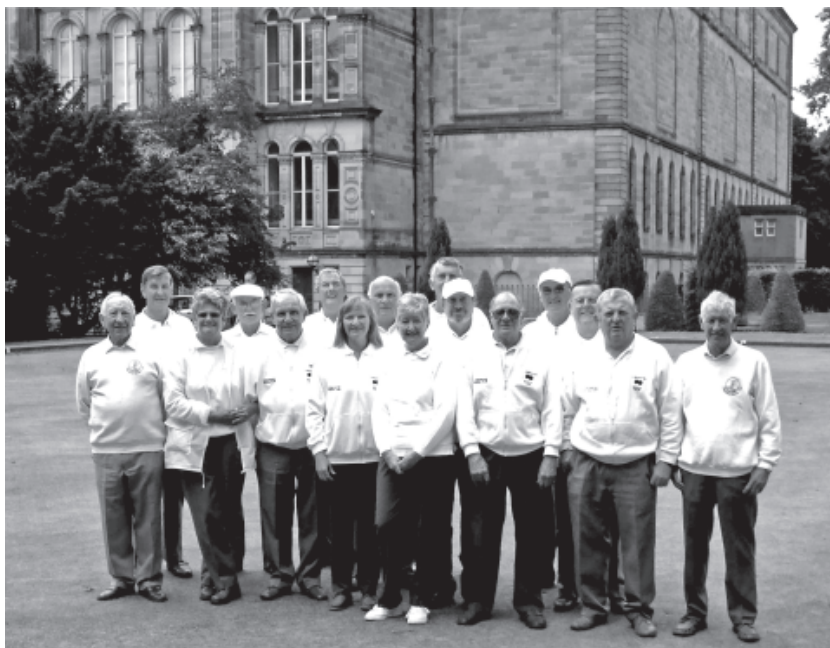
The Lanchester Bowls team who played a friendly match against Barnard Castle at Bowes Museum