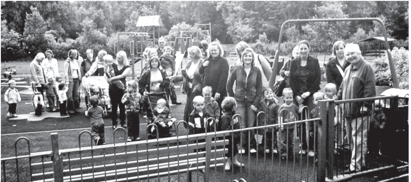
Children from the Playgroup and their parents on the Toddle in the play park

Playgroup and Tiny Tots held a sponsored toddle in the children's play park on Wednesday 27th July to raise funds for the group. Twenty