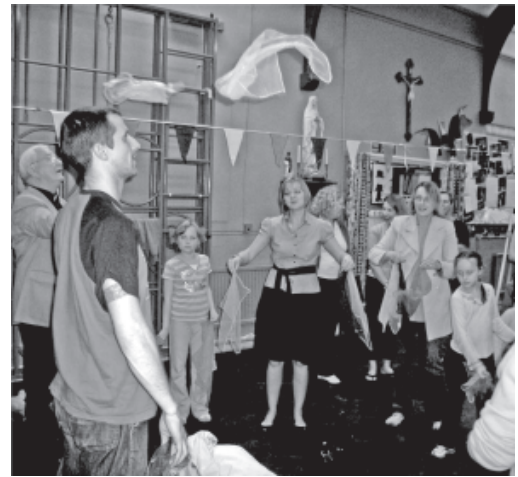
The children and parents trying their hand at juggling with scarves