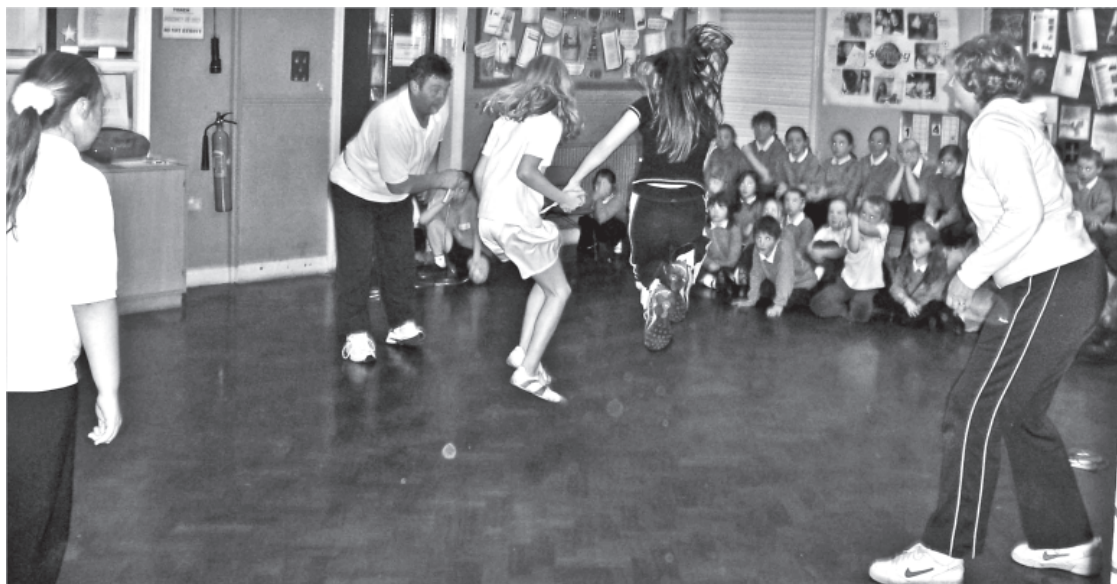
The fun of skipping being demonstrated at All Saints School

£285 for the British Heart Foundation through a sponsored skip at school - and had great fun into the bargain!