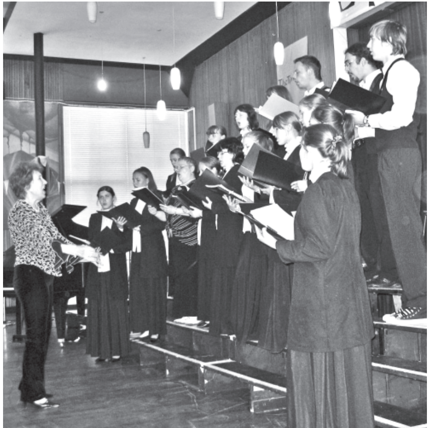
The Russian Choir who sang so harmoniously and with some fabulous harmony both with and without accompaniment

The final part of the concert was a selection of Russian folk songs,