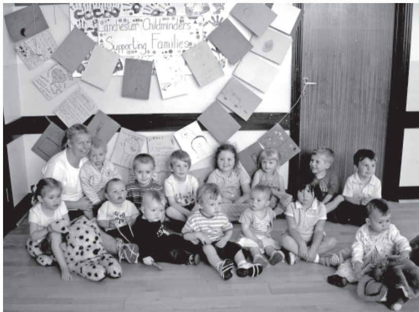
Children from Lanchester Childminding Group with the display made with help from their parents

"Supporting Families" throughout the year was this year's theme for National Childminding Week held from 16th - 23rd June. The Children and Registered Childminders of