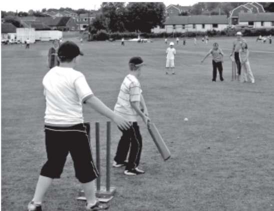
A keen match at the schools cricket festival

On a perfect day for cricket, Kitswell Park hosted the Derwentside School Sport Partnership Cricket Festival. The field was awash with primary school children all enjoying one of our major national sports. Nineteen teams entered the 'competition' with some schools supplying two teams.