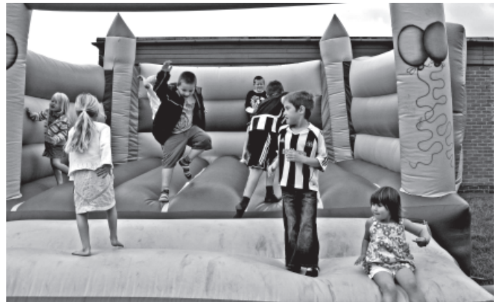
Both watching and jumping is fun on the Bouncy Castle