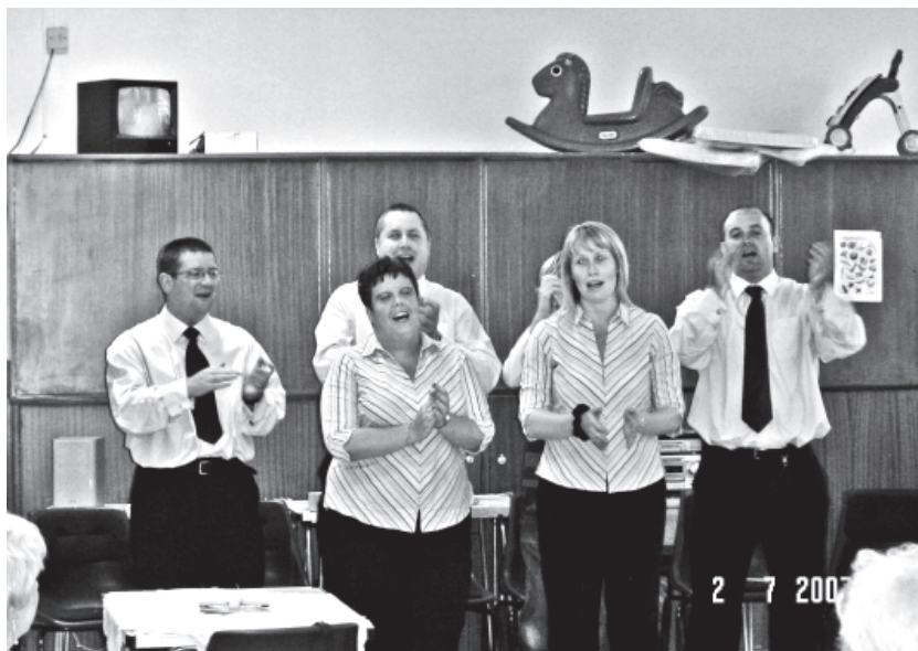
The Manse Singers providing their varied entertainment at the Strawberry Supper of the 2nd of July

Meeting on 6th October at Elvet Methodist Church is a five-line Limerick. The opening line is 'At an Institute meeting one night'... Any ideas, please?