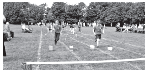
The obstacle race nearing its end.