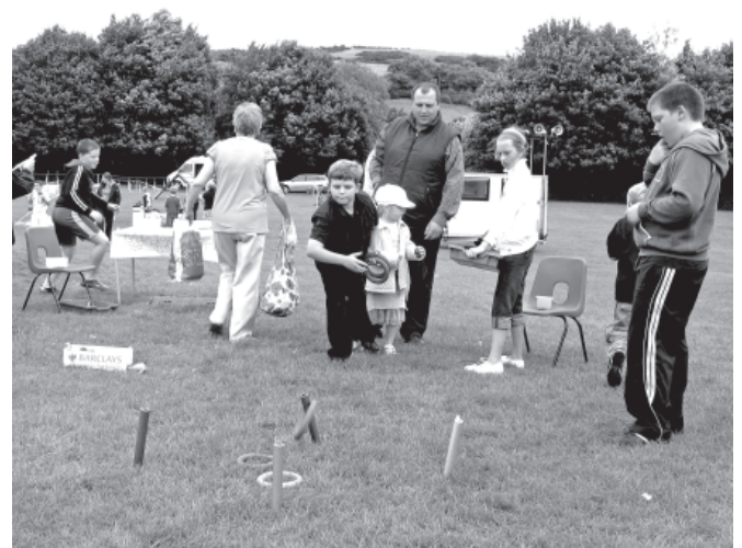
Hoop-la at EP school Fair