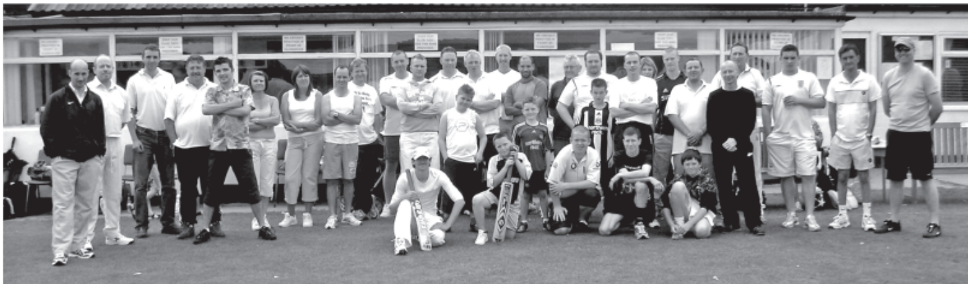
Three of the teams ready to compete