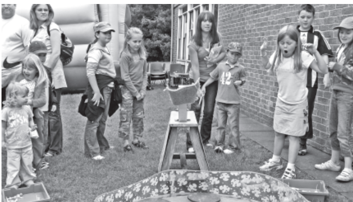
The Frog-Hopping causing consternation