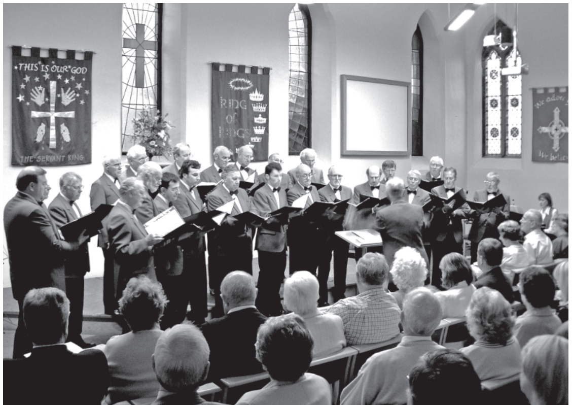
A packed audience listens to the Male Voice Choir