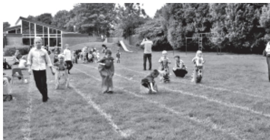
Maximum effort and enjoyment being put into the sack race

activities but also included a relay; running with skipping ropes; football skills; hockey skills and netball. They were two lovely afternoons for the children, parents and staff who all seemed to thoroughly enjoy themselves. The Normans happened to obtain the most points but the children were really interested in the sweets and ice cream treats that they all received at the end.