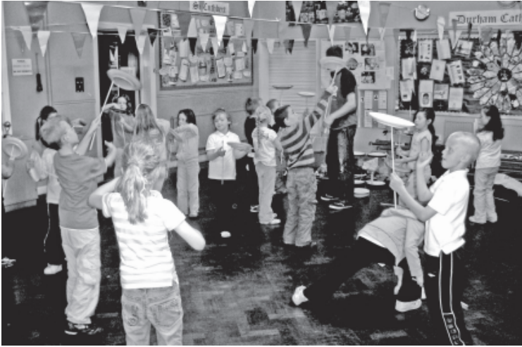
Children at All Saints' school learn to spin plates

could be taken. Later he showed another of his skills at the end of school-time by doing baffling magic tricks with coins and playing cards for parents and children.