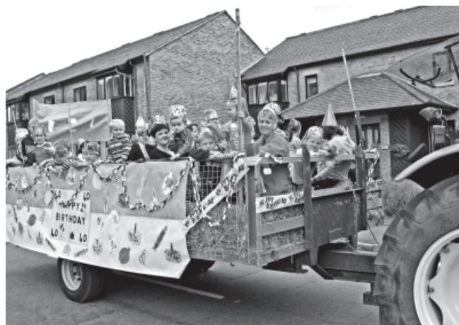
The Playgroup float taking part in the parade