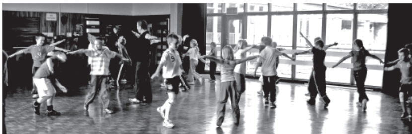
Youngsters get an introduction to dance

A keen game of rounders between staff and pupils rounded off the week nicely. This is the second year of Fun and Fitness Week and it has become a very popular event.