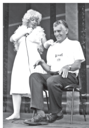
This Marilyn Monroe is no lady