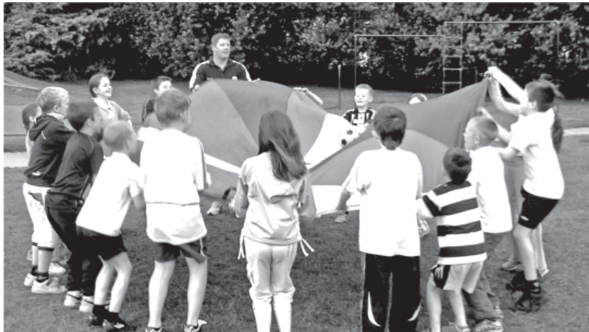
This game consists of throwing the ball from one side to the other of the 'tarpaulin' – or vice versa of course