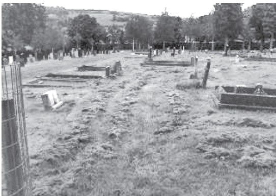
The picture on the left shows the 'dreadful state' of the newly-cut grass at the Kitswell Road cemetery

Mr Mark Fish, of Sones Landscaping, contracted to Derwentside District to cut the grass in the cemetery, states that the work is done well. The contract does not include removing cut grass. Ed.