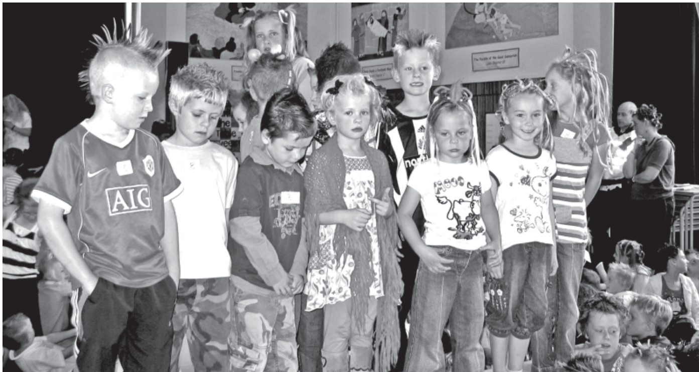
The finalists in the Wacky Hair competition

Lanchester EP School must have had its noisiest day ever for their Wacky Hair Day, as everyone chanted the name of their favourites as they paraded on stage.