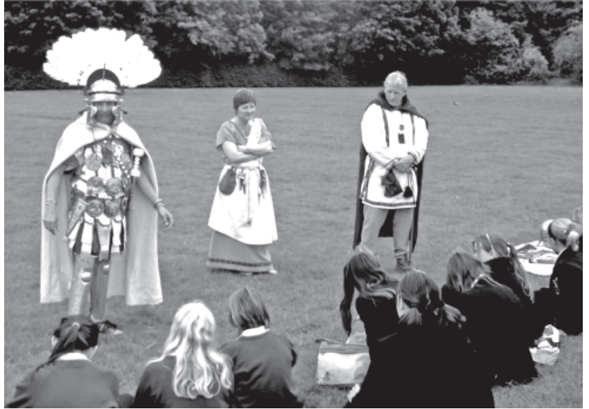
Straight from the equus' mouth - members of Roma Antiqua recount their lives to pupils at the Education Pack launch