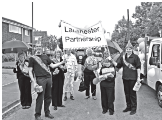
Members of Lanchester Partnership join the parade