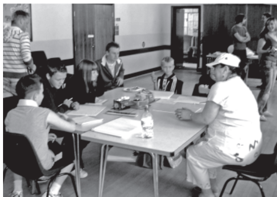
Part of the arts and crafts at the SPICE event