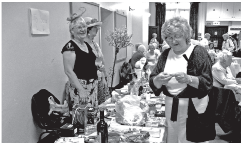
Have I won on the tombola?