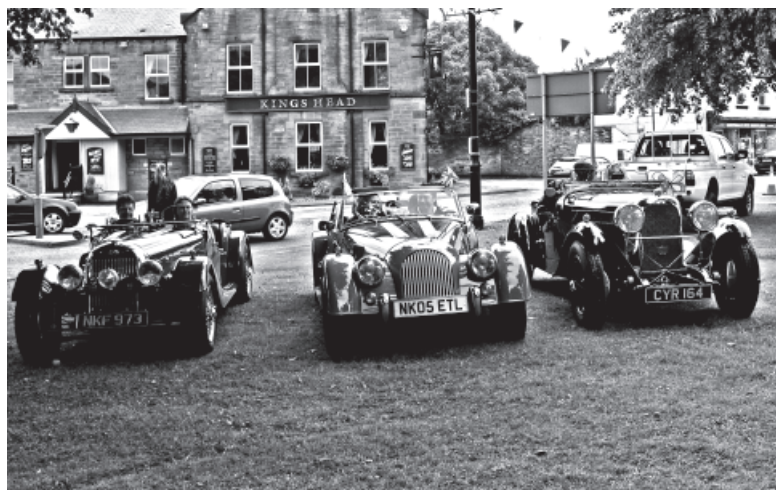
Macdonalds' stable of racy cars