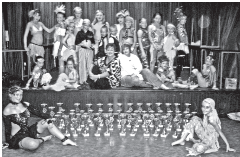
The dancers with their serried ranks of trophies