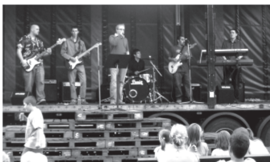
Lanchester's finest music makers, the Gents