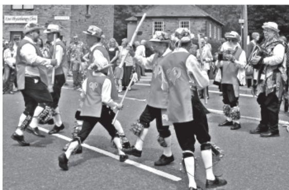
The Durham Rams Morris men