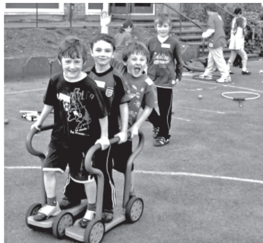
Just watch this thing go! Experimental proof that six feet are better than two.