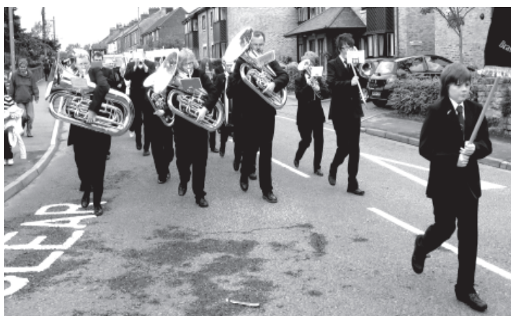
Lanchester Brass Band inspire the parade