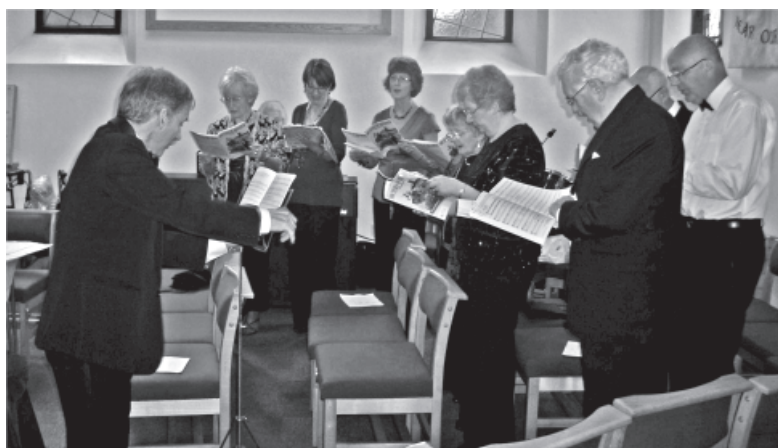
Members of the Operatic Society serenade the cake fanciers in the Methodist Church