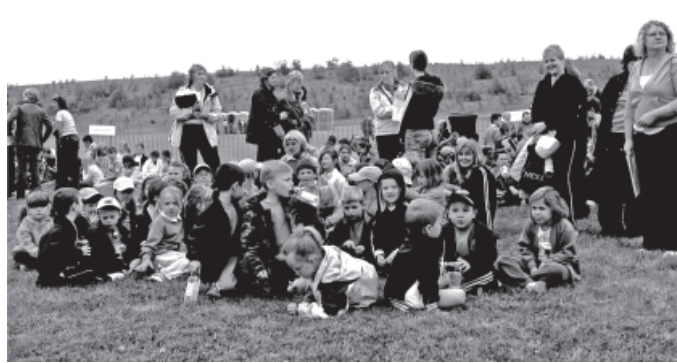
All Saints School getting ready for the run