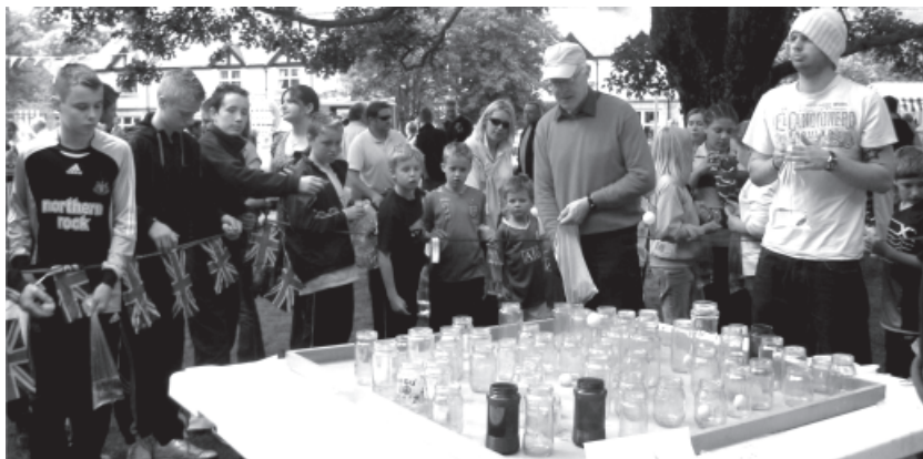
The most popular stall on The Green – put a ping-pong ball in the jam-jar, get a goldfish