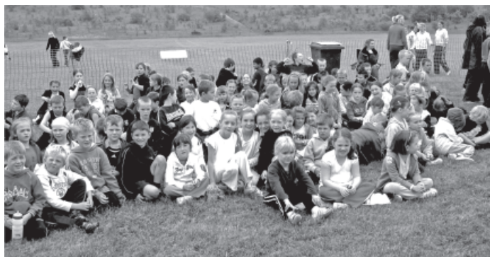
Lanchester EP School pupils preparing for the run

medal; a sports bag; a tee shirt; some swim vouchers; leaflets about the Louisa Centre and a bottle of water. The logistics of organising such an event were massive but staff at Derwentside carried this out admirably.