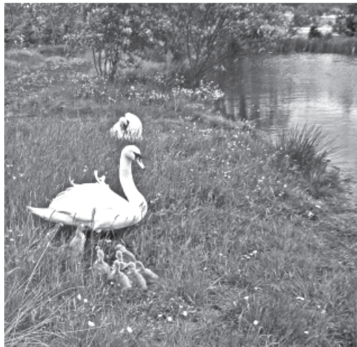
Mother takes good care of her cygnets as father looks on