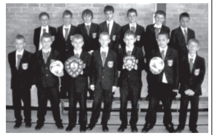
St Bede's Year 7 football team with their trophies