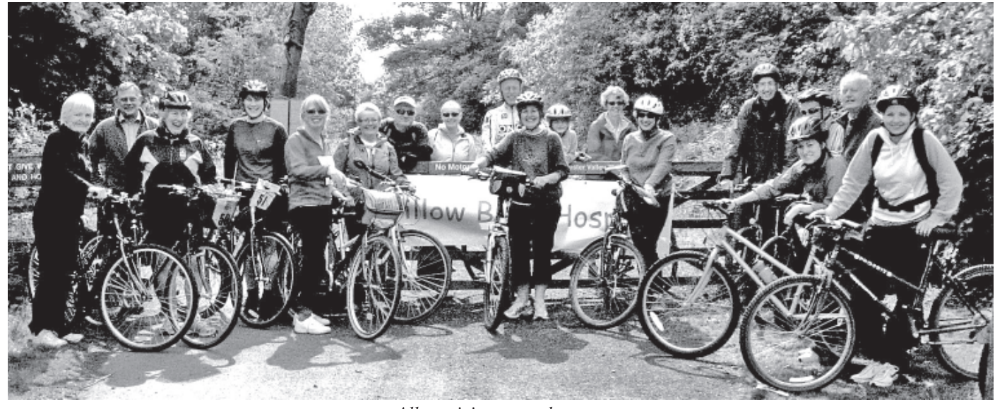
All participants at the start

Willow Burn Hospice ran their Annual Sunflower Cycle Ride from Lanchester to Broome Park glorious in sunshine. The event took