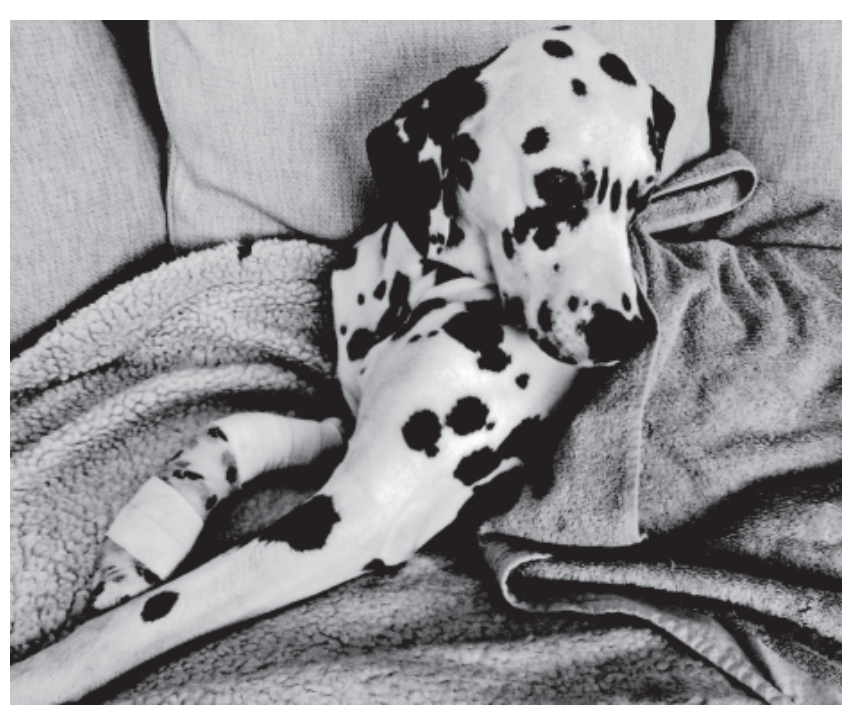
Peppa back at home, laying down and nursing her badly lacerated leg

dreadful occurrence happening again, with possibly an even worse outcome.