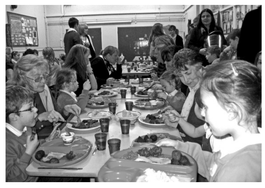
Mothers and children from All Saints RC Primary enjoying school lunch together to celebrate Mothering Sunday

on the faces of the Flan and Salad as a main as they course, with Apple a Sponge and Custard, or Yoghurt to follow. meal. Fifty eight Special biscuits were lunch alongside their mothers arrived for then given to the two sittings for a mothers to celebrate