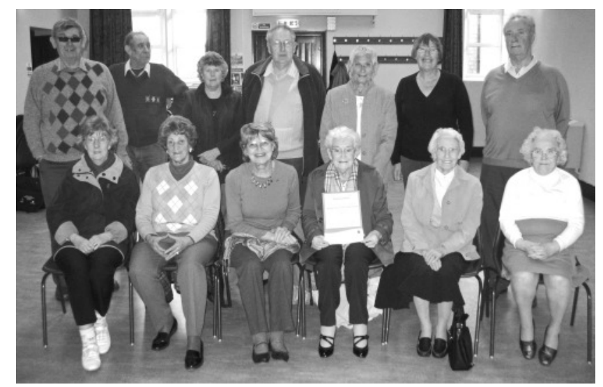
Members of the Breathe Easy Group with their certificate for running for 10 years

lot of friendship. We go We would like to the the taken just after we had Lanchester Lions who have recently given the