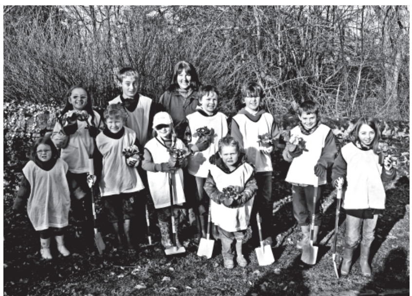
Children of Satley at the launch of the new Sunflower Club, looking really proud and splendid in their new bright yellow jackets

Satley by a local spades and rakes. resident. Hodgson. As Karen planned are: said, "There are no - tidying the village; play facilities in Satley - planting the village supervise their own and it would be good for the children of the - hanging baskets; village to socialise, - habitat boxes and develop good habits, create a community - bulb planting; spirit and at the same - leaf collecting; time to improve the - a picnic; village".