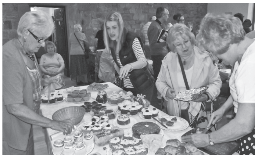
Plenty of activity on the Cake Stall