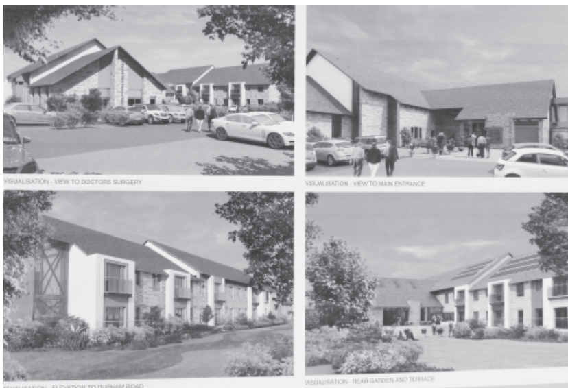
Visualisations of the Lynwood House Development