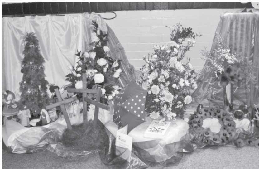
The Village green