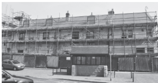
Lanchester Arms, scaffold erected, all set, ready for demolition.