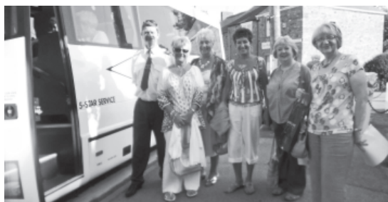
Church Wives setting out for their 'Day Away' on July 6th