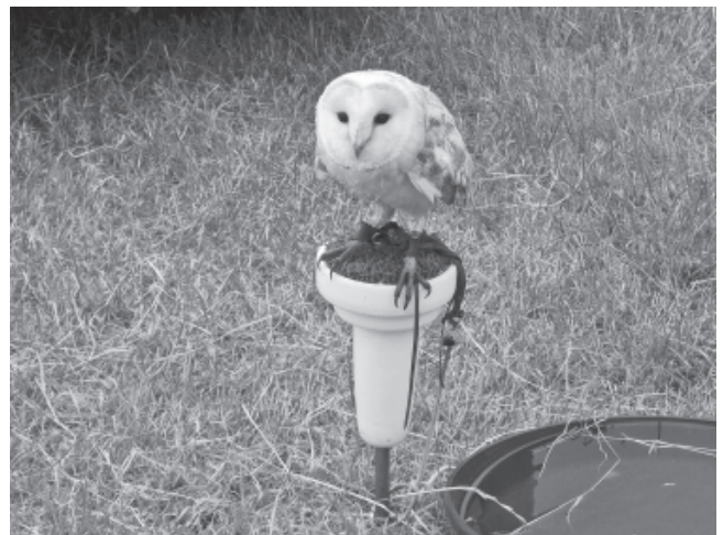
Barny the Owl loves to show off to admirers! The birds of prey attracted a lot of interest!