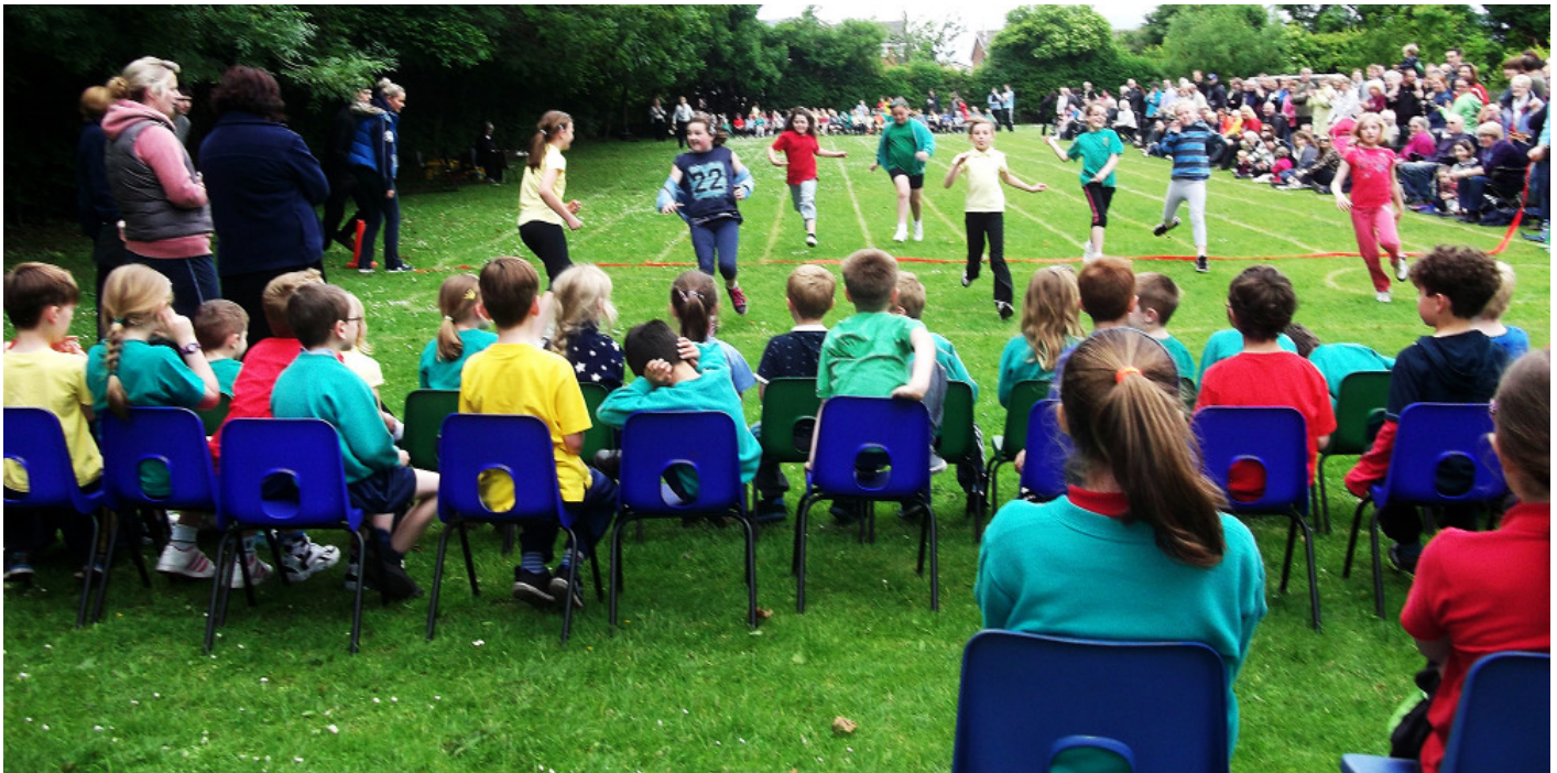
Will there be a future Olympic athlete among us? The picture shows a very competitive race, watched by a large crowd of staff, parents and friends.

All Saints' Primary School held their Summer Sports Day on June 24th this year.