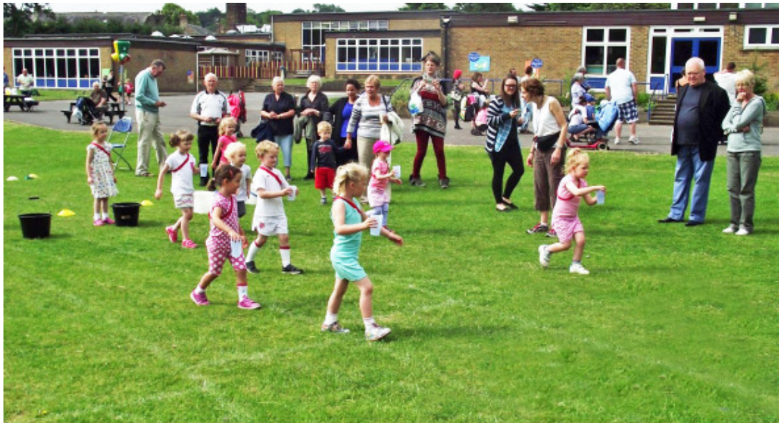
Foundation children enthusiastically running to fill the buckets with water