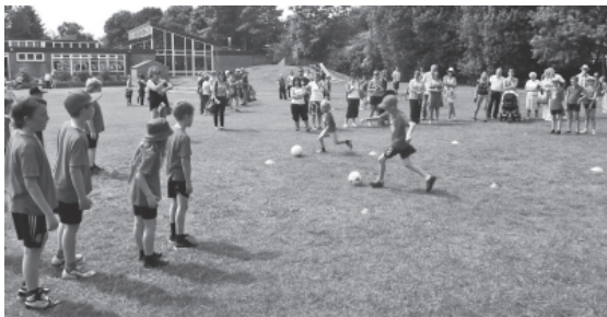
Future Premiership footballers?