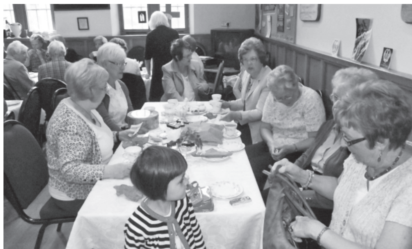
A large group of people enjoying friendship at the Summer Fair