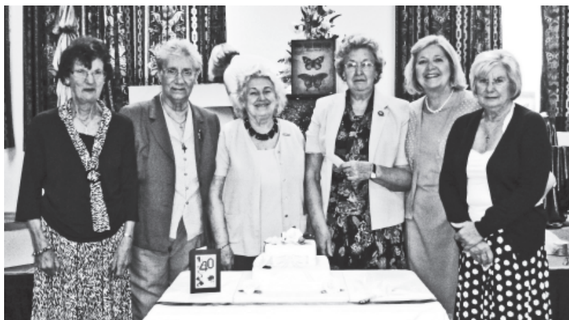
The Flower Club committee with their Anniversary cake